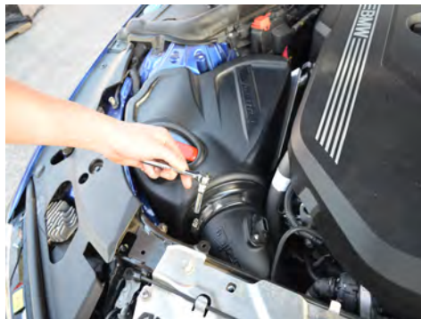
20. Secure the clamp on the twist lock filter.