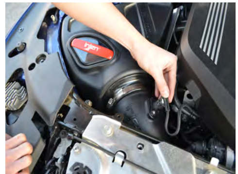
21. Plug in the temp sensor haarness.