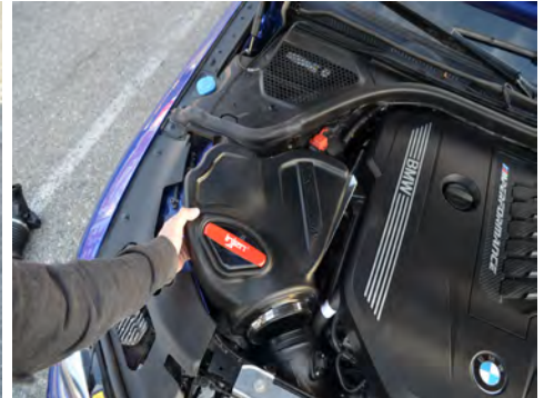
16. Install the Injen air box into the engine bay. Line up the studs on the air box to the factory grommets and press down on the box.