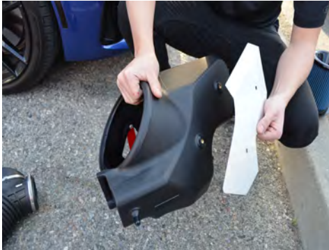
16. Bolt down the provided heat shield to the Injen air box.