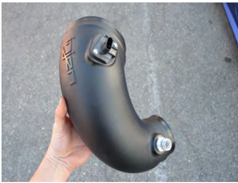
13. Install the temp sensor onto the Injen tube and secure using the provided M4 button head screws.