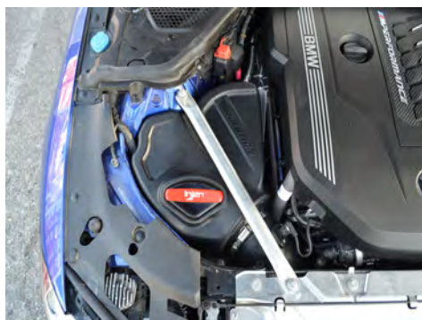
23. Ensure all bolts and clamps are secured properly.

Congratulations! You have just completed the installation of this intake system. Periodically, check the alignment of the intake, normal wear and tear can cause nuts and bolts to come loose. Note: Check clearance and adjust if needed! Failure to check the alignment and adjust the intake can cause damage that will void the warranty. Injen Technology is not responsible for any damages caused by/ from improper installation.