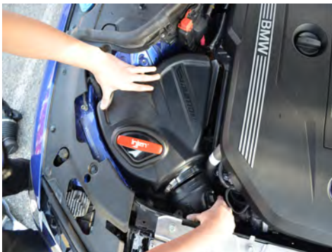
19. Press the Injen tube into the twist lock filter.