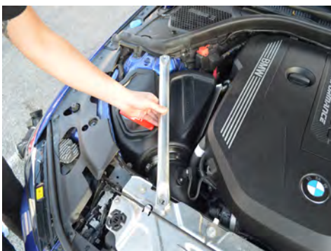
22. Reinstall the strut tower brace.