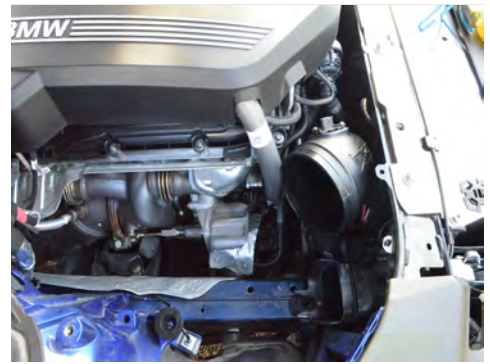
15. Secure both clamps on the 3.50" hump hose.