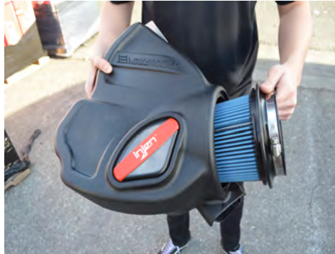
17. Install the twist lock filter on to the Injen air box. Once seated, rotate the filter a 1/4 turn in either direction so the filter can lock into place.