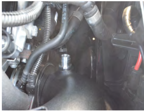
14. Install the Injen tube and attach the crank case line to the machined fitting.