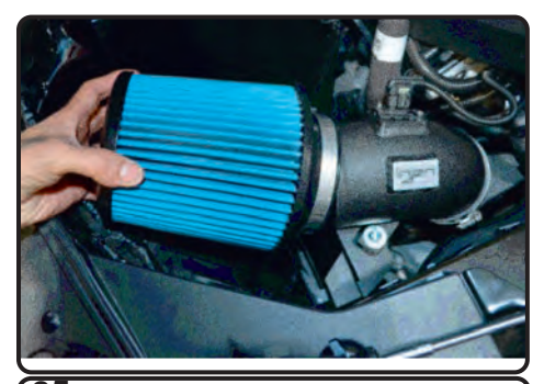
25. Install the air filter to the intake tube.