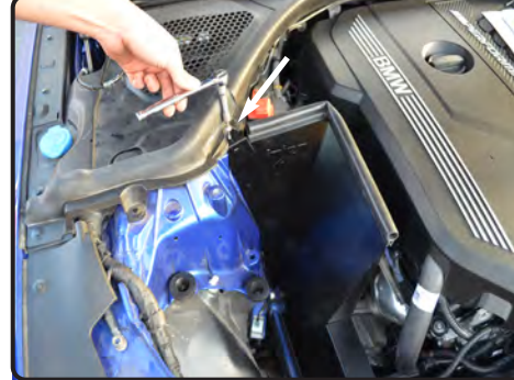
16. Secure the tab on heatshield using the OEM torx screw. Secure and tighten.