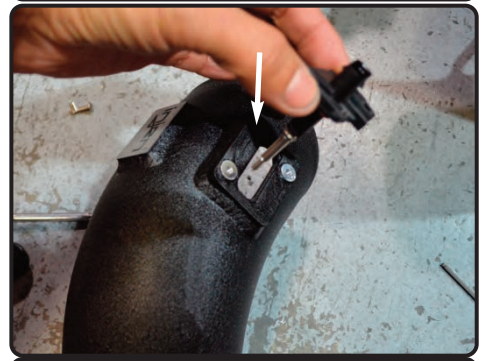
19. Re-install the temp sensor into the new injen intake tube and secure using the provided M4 button head screws.