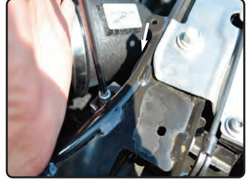
15. Secure the heatshield tab to the radiator support using M6 screw and M6 nut. Secure and tighten allen key.