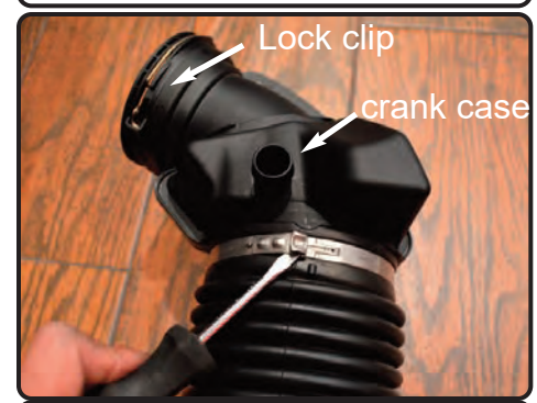
5. With a flat head screw driver, pull back the lock clip on the turbo. Slide out intake tube from turbo. Disconnect the crank case line on the intake tube by depressing clip. With flat head screwdriver, break the security clamp loose.