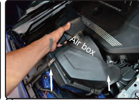
4. Carfully lift up and remove the airbox from the vehicle. Note: Next photo intake tube was removed for easier look at intake tube and for photos.