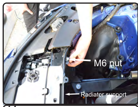
14. Make sure the heatshield is flat on frame. Locate the hole on the radiator support.