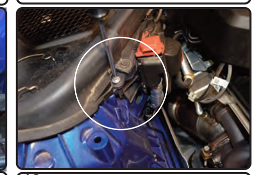
12. Loosen the T30 torx screw located near Postive battery terminal. Save bolt for later install.