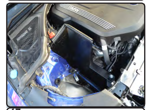
17. Complete heatshield assembly installed. Tighten all screws and secure.