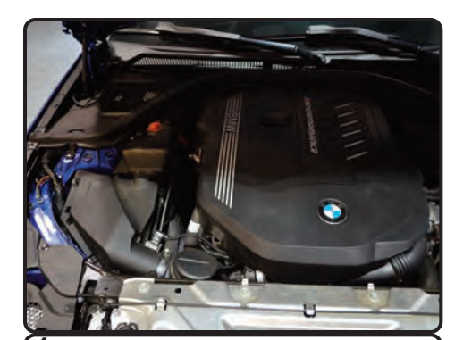
Stock intake system shown.