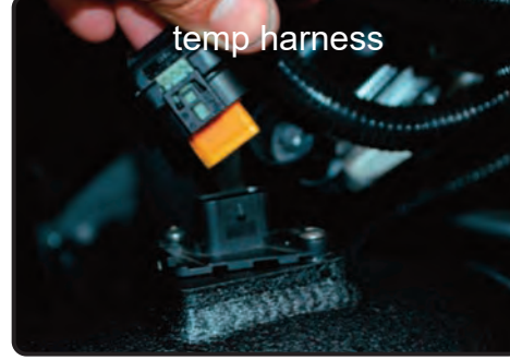
24. Re-connect the temp harness.