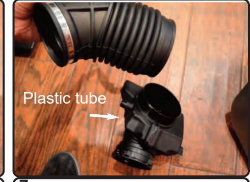
7. Remove the intake tube from the hard plastic intake tube. Make sure the Lock clip is seated correcty in the intake tube to allow the tube to secured properly to turbo.