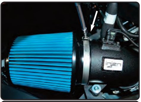
26. Secure and tighten using 8mm nut driver. Re-adjust if you need to and retighten intake tube.