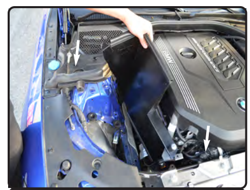
13. Install the heatshield into vehicle. Front tab will fit under the radiator support.