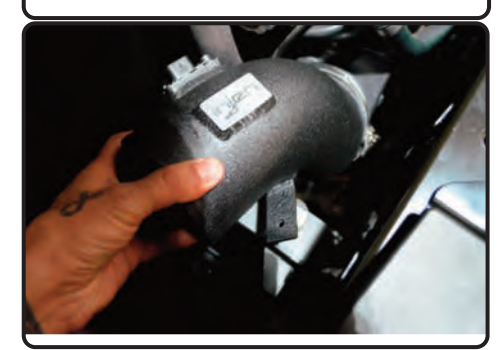
21. Install the intake tube into the vehicle and position to the straight hose and bracket to the vibramount.