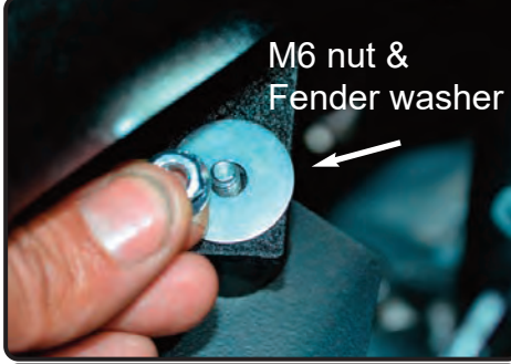
22. Secure the bracket on intake tube using provided M6 nut and fender washer. Tighten using 10mm socket or wrench.