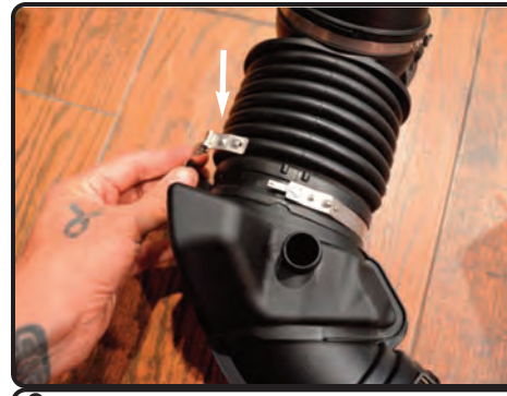
6. Remove the security clamp from intake tube.,