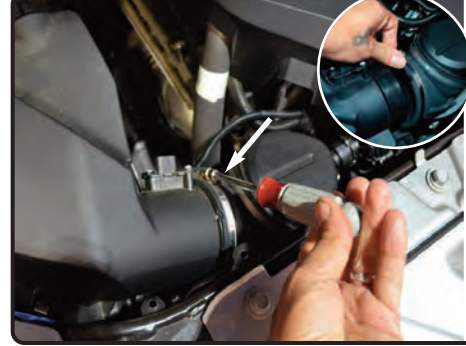
3. Loosen the clamp on the air box using 6mm nut driver. Pull back the intake tube from the air box.