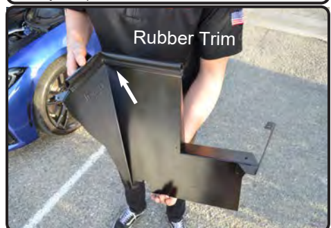
9. Intall the provided Rubber trim to the top of the heatshield. Notch corner with pliers/cutters for easier installation.