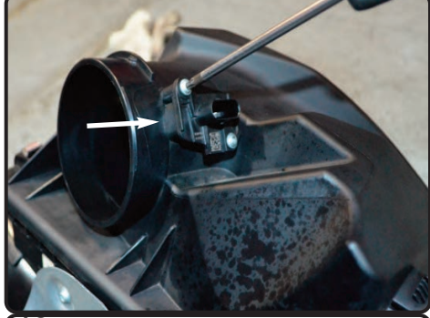
18. Loosen the 2 screws holding in the temp sensor using T25 torx bit and remove from air box.