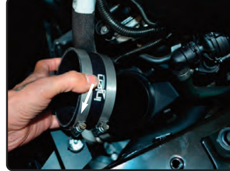
20. Install the provided 4" straight hose with clamps to the plastic intake tube. Tighten clamp on the plastic tube only.