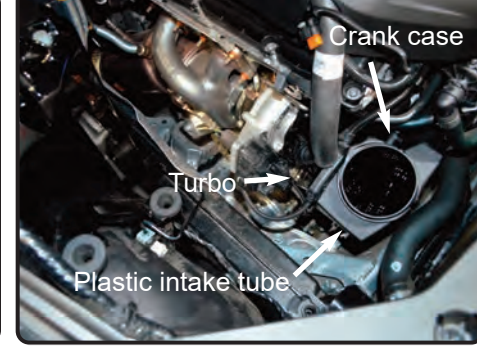
8. Re-install the plastic intake tube into the vehicle. Re-connect Crank case line. Make sure you hear a click, tug on tube to make sure the tube is secured to turbo and will not come off.