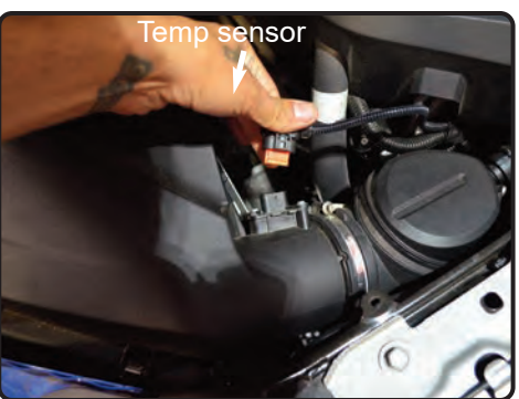
2. Disconnect the Temp sensor harness and pull harness cable from the air box.