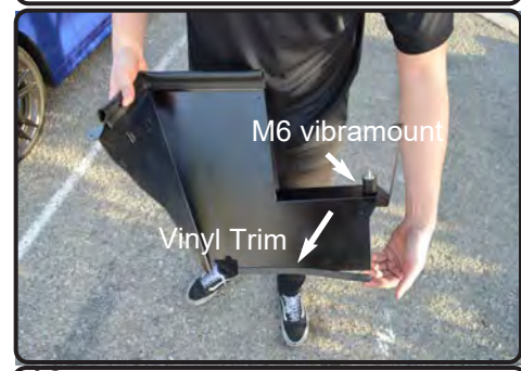
10. Install the provided Vinyl trim to the bottom of the heatshield. Install the M6 vibramount to the Thredded