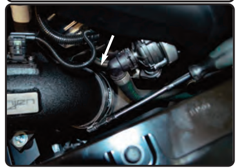
23. Tighten the clamp on the intake tube using 8mm nut driver.