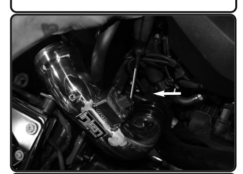
20. Postion the intake for best fit and tighten clamp using 8mm nut driver.