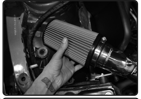
22. Install the filter to the intake tube. Secure and tighten the filter using 8mm nut driver.