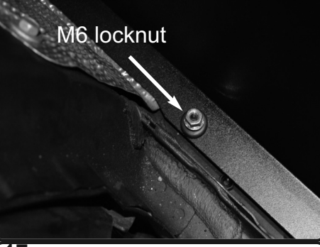
17. Secure and tighten the bottom of the heat-shield using provided M6 lock nut. Secure and tighten using 10mm socket or wrench.