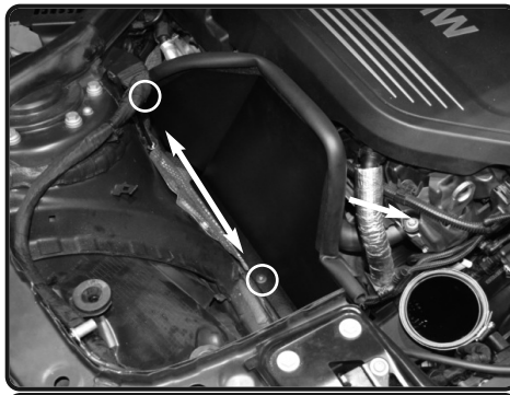
15. Push and secure and make sure the grommets are seated and secured to the studs.