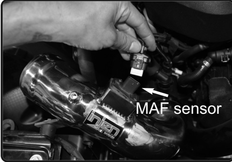
21. Reconnect the MAF sensor harness.