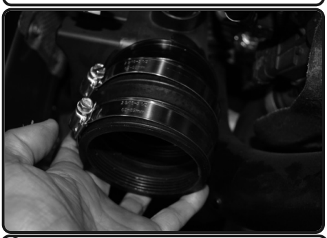
9. Install the provided step hose with clamps to the turbo.