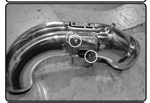
8. Install the MAF sensor in the correct direction. Secure using the provided M4 screws. Tighten using 2.5mm allen key.