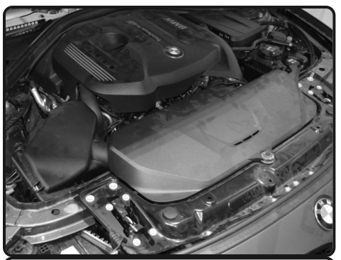
1. Stock intake system shown. Lift up and remove the front radiator cover.