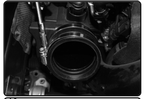
10. Tighten the clamp on the turbo side only using 8mm nut driver.