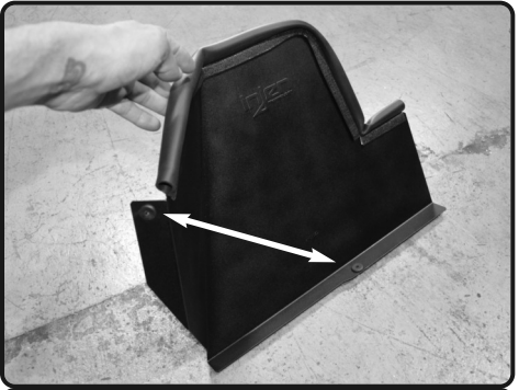
13. Make sure the grommets are seated and secured.