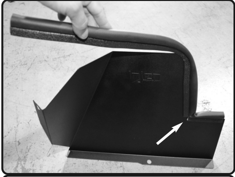
6. Install rubber trim to the top of the heatshield. Notch corner for easier installation.