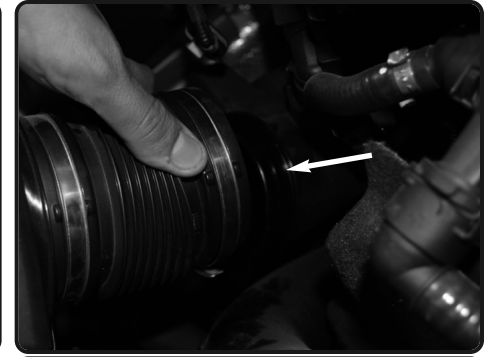
7. Loosen the clamp on air box and pull back the intake tube.