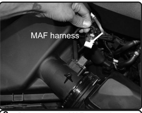
2. Disconnect the MAF sensor harness.