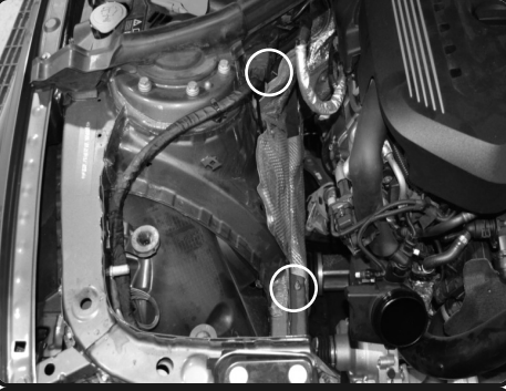
5. Locate the 2 threaded studs in the engine compartment, this will be used for the heat shield