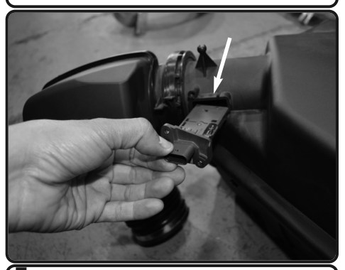
7. Remove the 2 screws holding in the MAF sensor using T25 torx bit.