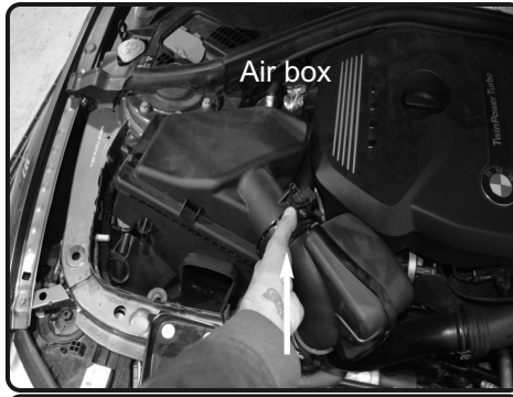
3. Now lift up and pull the entire air box assembly out of the vehicle.