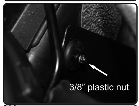
16. Secure the tab on heatshield near firewall using the provided 3/8" plastic nut. Secure and tighten.