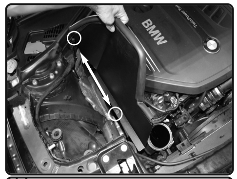
14. Install the heatshield into the vehicle and position the 2 grommets to the studs from step 6.