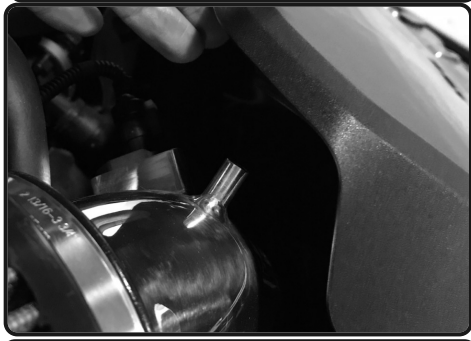
23. Re-install the radiator cover. Note: fitting on intake tube is for grommet on radiator cover to seat and secure.