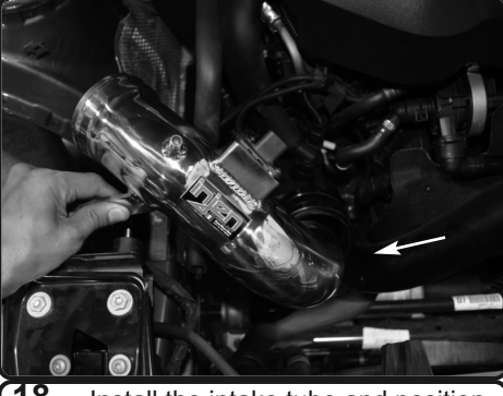
18. Install the intake tube and position the bracket to the vibramount.