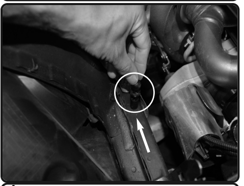
4. Carefully lift up and remove the entire stock air box assembly.