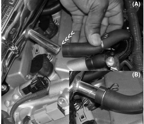
Take the stock breather hose and press it over the 5/8 intake port (A), the tension clamp is used to secure the hose over the intake port (B).