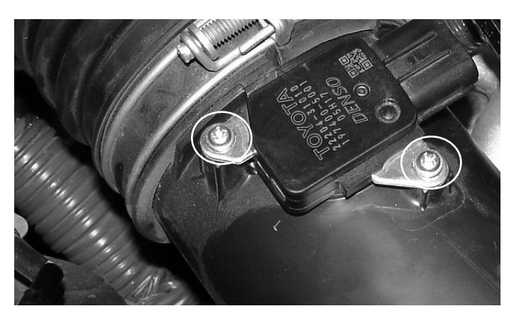
Loosen and remove the two screws that fasten the MAFS to the sensor housing.