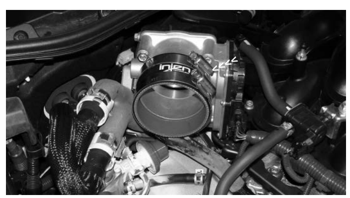
Press the 3\, straight hose over the throttle body and use two power clamps. Use two power-clamps and be sure to tighten the clamp directly over the throttle body end for now.