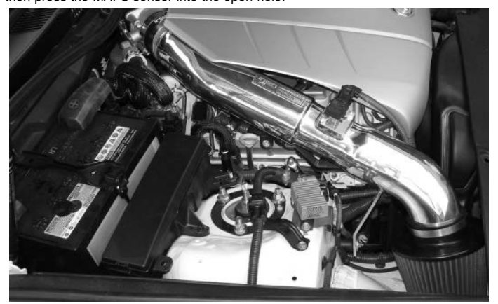
Align the entire intake for the best possible fit. Be sure the intake does not rub or hit any moving parts in the engine compartment, once you have checked the entire intake, continue to tighten all nuts, bolts and clamps.