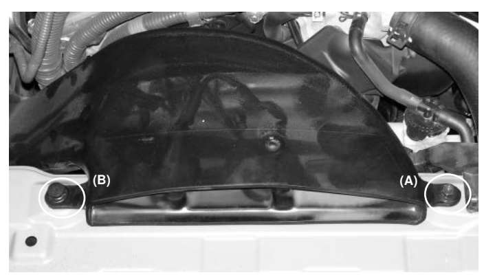
Loosen and remove one bolt (A) depress and pull the last remaining plastic clip (B) now holding the air scoop in place.