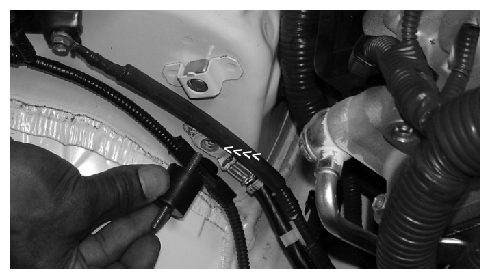
Once the screw has been removed, continue to place the vibra-mount into the pre-tapped hole as shown above.