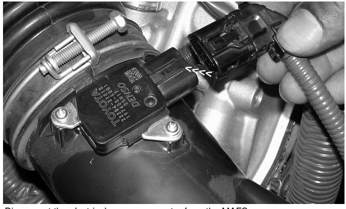
Disconnect the electrical sensor connector from the MAFS.