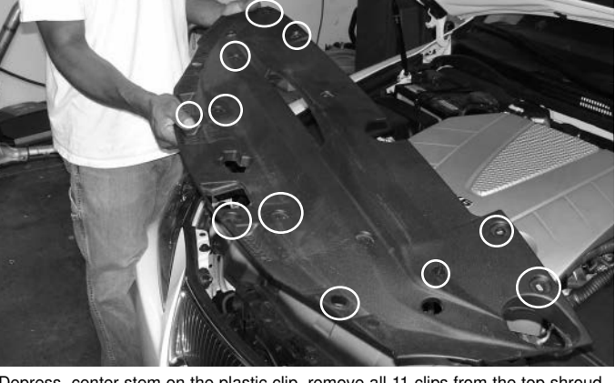
Depress center stem on the plastic clip, remove all 11 clips from the top shroud. Once all clips have been removed continue to remove the plastic front shroud.