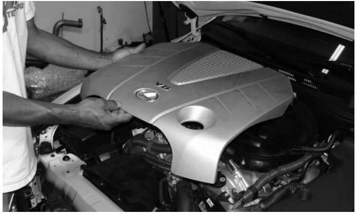
Pull the engine cover from the intake manifold by firmly pulling in a upward motion.