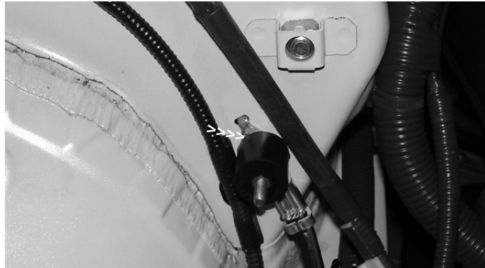
Screw vibra-mount firmly into the grounding wire pre-tapped hole until it bottoms out. Make sure the vibra-mount snug and tight over the grounding wires before moving on.