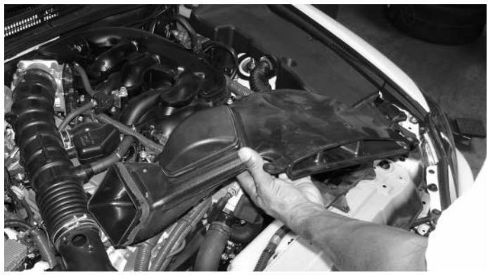
The front air scoop is now removed from its current location for now.