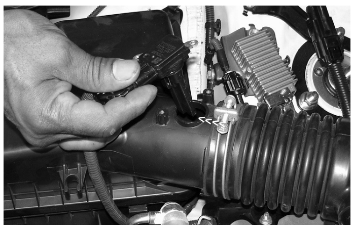
Remove the MAFS from the sensor housing as shown above. Set the MAFS to one side to be installed later in the instructions.