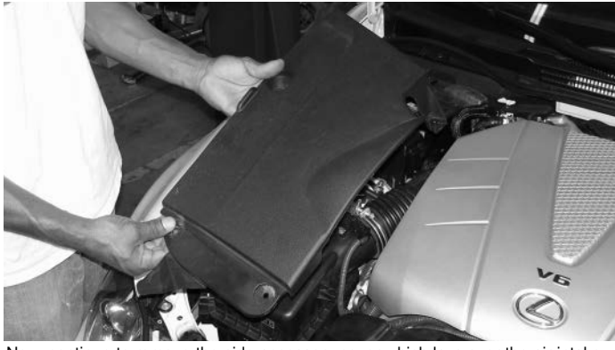
Now, continue to remove the side accessory cover which lays over the air intake box cleaner.