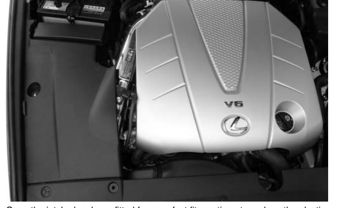
Once the intake has been fitted for a perfect fit, continue to replace the plastic air intake scoop, passenger side accessory cover and the engine cover.