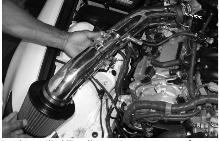
Insert the assembled air filter and intake into the engine compartment. Press the top end of the intake into the 3 throttle body hose, align the intake bracket to the vibra-mount stud and semi-tighten the clamp.