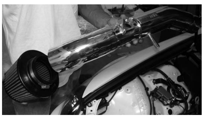
Slip the three inch filter over the end of the intake until it butts up against the filter stops. Once the filter has been firmly placed, continue to tighten the filter neck clamp.