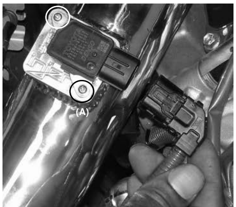
Use the supplied M4 screws to secure the MAFS in the sensor adapter (A). Firmly press the electrical sensor connector into the MAFS until it clicks in place