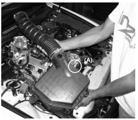
Lift and pull the air box cleaner from the lower grommets. Before you pull the air box out, unclip sensor harness and remove from the side of the air box (A).