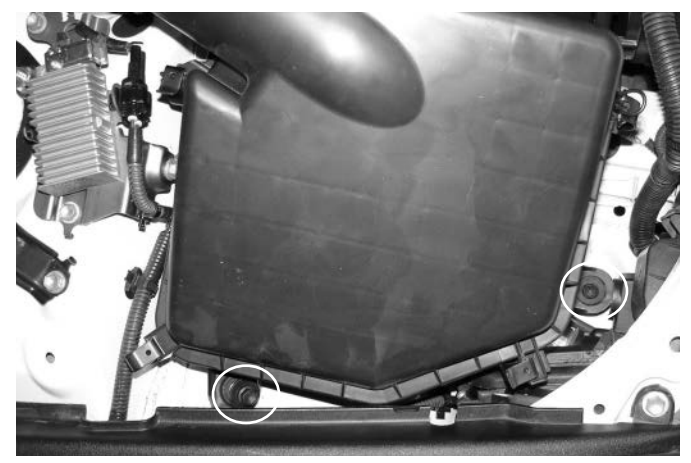
Loosen and remove the two bolts that secure the air box cleaner over the grommets.