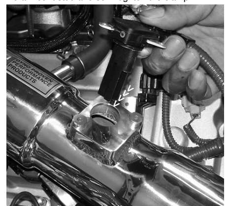
Prior to inserting the MAFS into the machined adapter, use a light weight oil around the O-ring then press the MAFS sensor into the open hole.