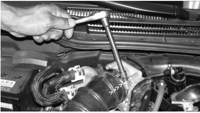
Loosen the only remaining metal clamp which secures the air duct to the throttle body as shown above.