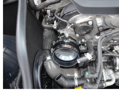
20. Attach the 4.00" hump hose onto the turbo inlet adapter. Secure the hose with the provided clamp.