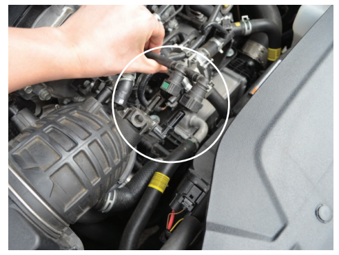
4. Detach both evap lines by holding the release button, then pulling the lines away tube to the airbox. from the evap fitting.