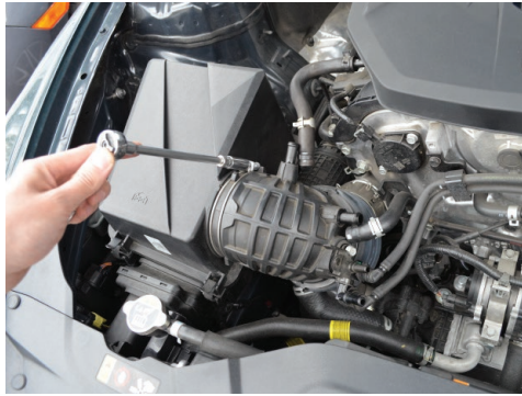
5. Loosen the clamp securing the intake