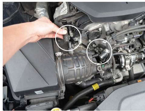
3. Disengage the tensions clamps securing both crank case hoses on top of the tube, then detach both crank case hoses.