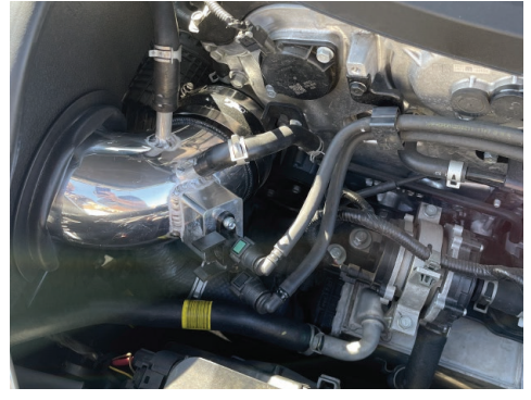
24. Secure the three crank case lines to the intake tube with the oem tension clamps. Reattach the evap lines to the evap fitting.