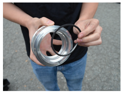
18. Install the O-Ring onto the turbo inlet adapter <u>in the same direction it was</u> <u>removed.</u>