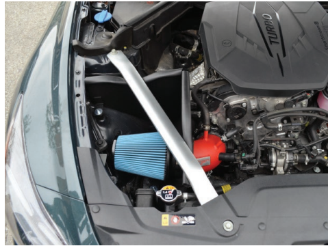
26. Reinstall the passenger side strut brace. Ensure that all bolts, clamps and hoses are properly secured.

CONGRATULATIONS! You have just completed the installation of this intake system. Periodically, check the alignment of the intake, normal wear and tear can cause nuts and bolts to come loose. Note: Check clearance and adjust if needed! Failure to check the alignment and adjust the intake can cause damage that will void the warranty. Injen Technology is not responsible for any damages caused by/from improper installation.