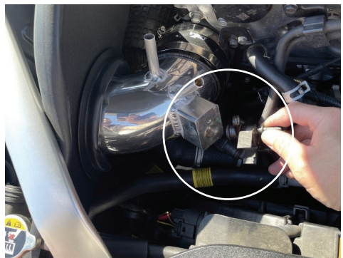
22. Install the evap fitting onto the intake tube. Ensure the O-Ring is still on the evap fitting.