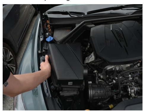
7. Detach the intake tube from the airbox, then remove the airbox from the engine bay.