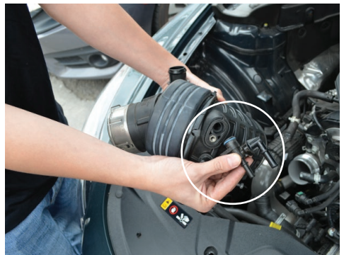
11. Detach the evap fitting from the intake tube. This fitting will be reused on the injen intake. Ensure the O-Ring stays on the fitting. 12. Secure the provided vibra mounts to the the threaded holes on the chassis. The bottom vibra mount will mount onto the threaded stud.