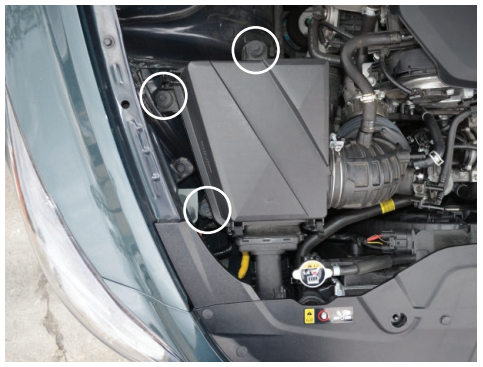
6. Remove the three bolts securing the airbox to the engine bay.