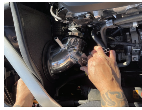
21. Install the injen intake tube, then secure with the provided clamp.