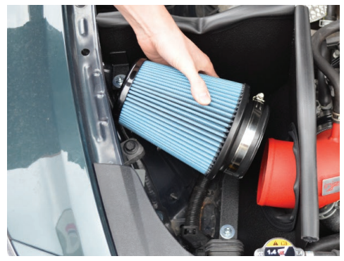
25. Install the air filter to the inake tube and secure using the provided clamp.