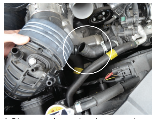
9. Disengage the tension clamp securing the bottom crank case hose, then detach the crank case hose.