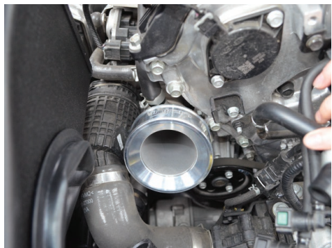
19. Attach the turbo inlet adapter to the turbo. You should hear the C-Clip engage once secure.