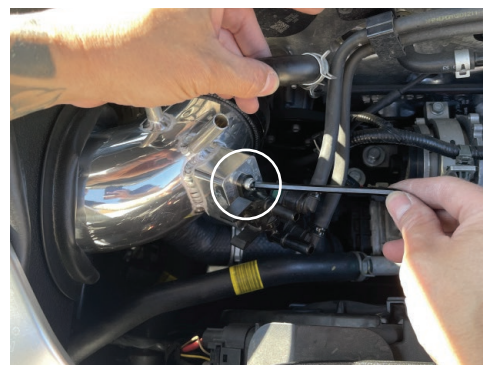
23. Secure the evap fitting with the provided M6 bolt.