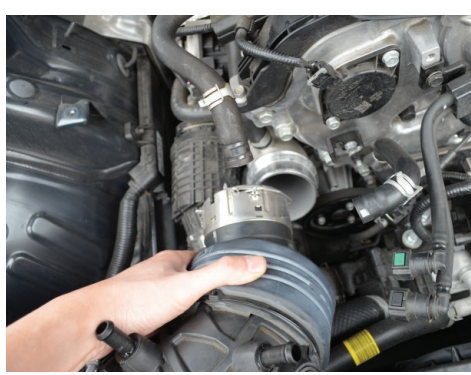
8. Disengage the C-Clip securing the intake tube to the turbo, then detach the intake tube.