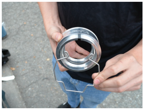
16. Install the C-Clip onto the injen turbo inlet adapter