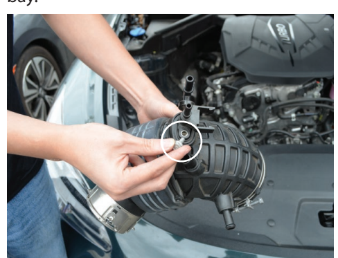
10. Remove the bolt securing the evap fitting.