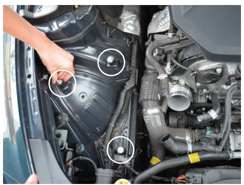
the the threaded holes on the chassis. The bottom vibra mount will mount onto the