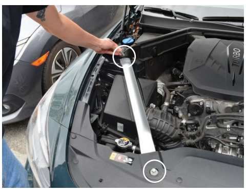
2. Remove the two bolts securing the passenger side strut brace, then remove the strut brace.