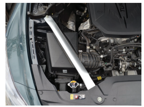
1. Stock intake system.