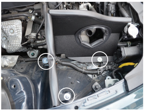
14. Attach the heatshield to the three vibra mounts, then secure the heatshield with the provided M6 nuts and washers.