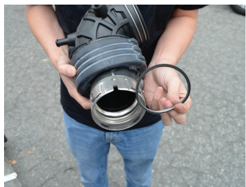
17. Remove the O-Ring from the intake tube. Take note of the direction it is removed in.