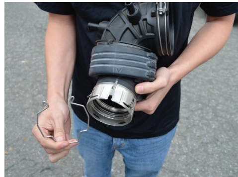
15. Remove the C-Clip from the oem intake tube.