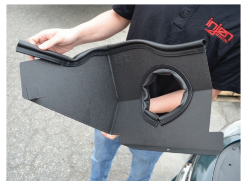
13. Attach the provided bulb trims to the heatshield. Crimp the bottom of the bulb trims for a better fitment.