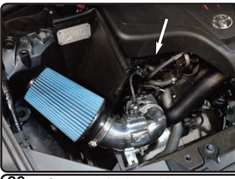
26. Secure and tighten using 8mm nut driver. Re-adjust if you need to and re-tighten intake tube.

25. Install the air filter to the intake tube.