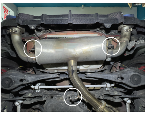
3. Detach the three hangers from the rubber insulators, then carefully remove the exhaust.

2. Remove the two nuts securing the mid pipe to the OEM muffler section.