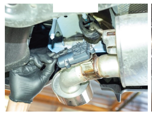
1. If equipped with exhaust valve, disconnect the exhaust valve harness. Secure the harness with the provided zip tie, it will no longer be used.