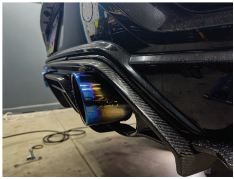
6. Adjust the exhaust tips to the desired

5. Insert the muffler section hangers into the rubber insulators, then secure the muffler section location then secure the clamps. to the front pipe with the provided clamp.