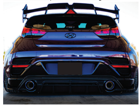
7. Ensure all bolts, nuts, and clamps are properly secured.

4. Insert the injen front pipe hanger into the rubber insulator, then secure the front pipe to the oem exhaust with the provided hardware. Ensure to use the provided exhasut gasket.