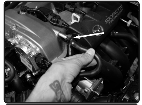
3. Pull out crank case line from engine fitting.