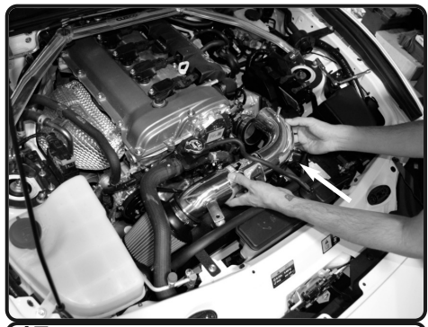
17. Install the 2.75" straight hose with clamps to throttle body. Now install intake tube assembly and position the tube to straight hose.