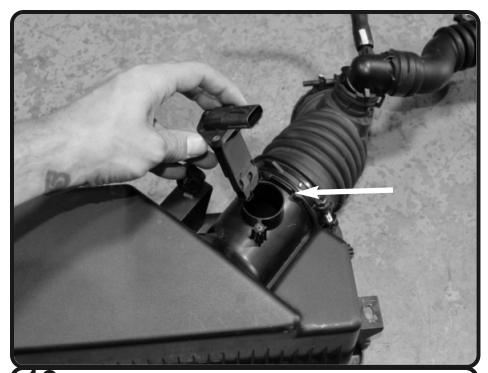
13. Loosen and remove the MAF sen-sor from the factory air box.