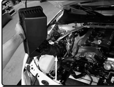
6. Carefully lift up and remove the upper stock air box assembly.