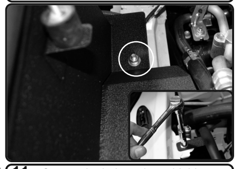
11. Secure the hole on heatshield to the M8 vibramount using provided M8 nut and washer. Secure the bracket using original screw from airbox and tighten.