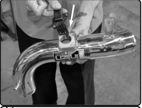
14. Install the MAF sensor into the new intake tube.