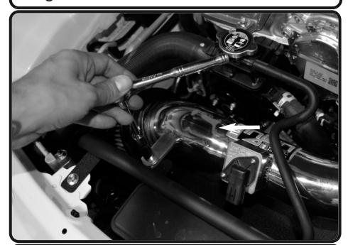
21. Tighten the vibramount using 10mm socket and ratchet.