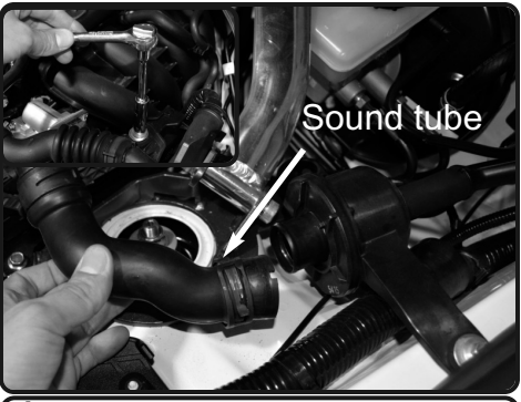
4. With pliers, bull back the line from sound tube. Loosen the 10mm screw holding in the sound tube.