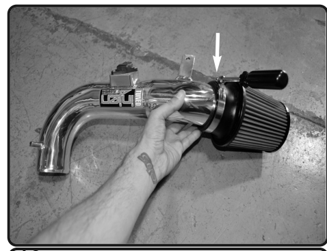
16. Now install the air filter to the tube and tighten using 8mm nut driver.