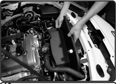
10. Install the heatshield into the vehicle. Position the grommet on heatshield to origi-nal air box fitting.