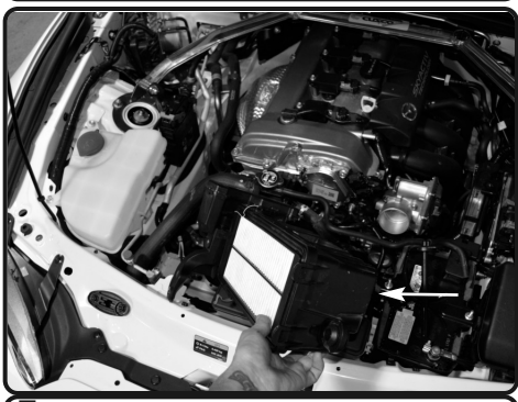
7. Now carefully remove the bottom air box assembly by pulling up from vehicle.