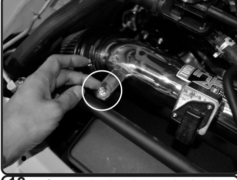
18. Secure the bracket on the intake tube to the vibramount on the heatshield using fender washer and M6 nut.