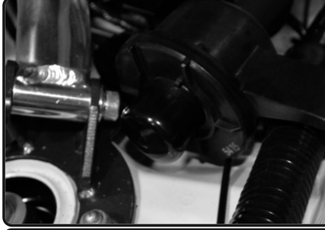
24. Make sure the vinyl cap is secured.