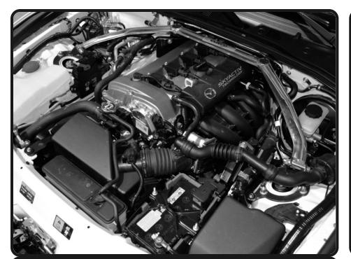
1. Stock intake system shown.