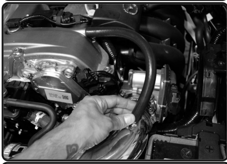
22. Now connect the provided 10mm hose to the engine fitting and intake tube.