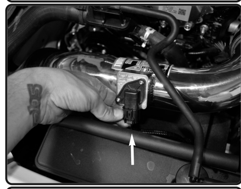
20. Re-connect the MAF sensor harness.