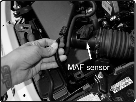
2. Disconnect the MAF sensor harness.