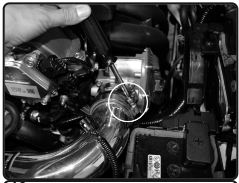
19. Position for the best fit and tighten the clamp on throttle body.