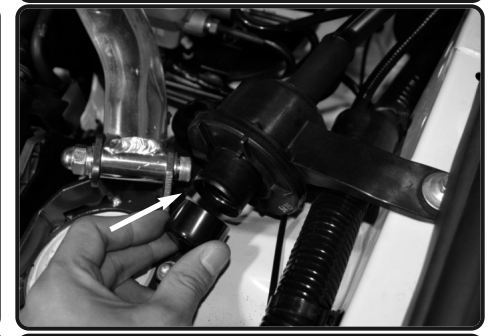
23. Install the provided vinyl cap to the sound tube muffler.