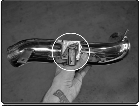
15. Secure using M4 button head screws and tighten using 2.5mm allen key.