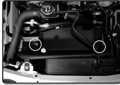
12. Verify the 3 points are secured on the heatsheild.