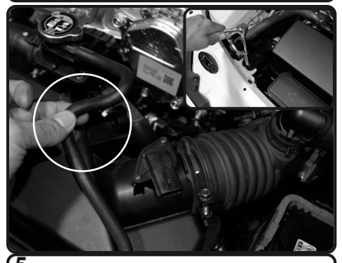
5. With 10mm socket and extension and ratchet, loosen the screw holding in the airbox on radiator support and clamp on throttle body. Pull back the coolant line from air box. Save screw for later install.