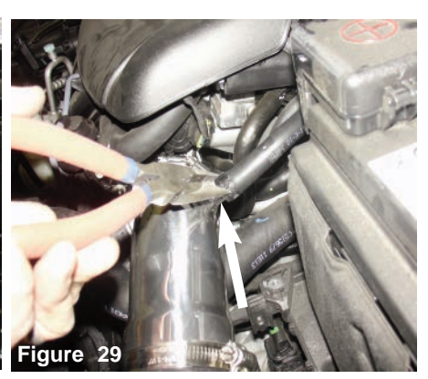
Secure using the factory clamp. Re-install bumper cover and connect battery terminals.