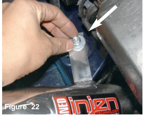
Now secure the bracket using provided M6 washer and nut.