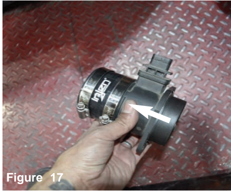
Install the provided 2.75" straight hose with clamps to the back of the MAF sensor. Note: pay attention to arrow on the MAF. Direction towards throttle body.