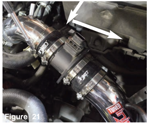
Tighten the clamp only on the intake tube side using 8mm nut driver..