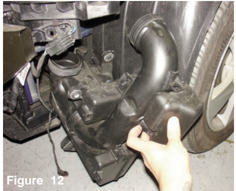
Pull any lines that are attached or on the resonator and remove from the vehicle.