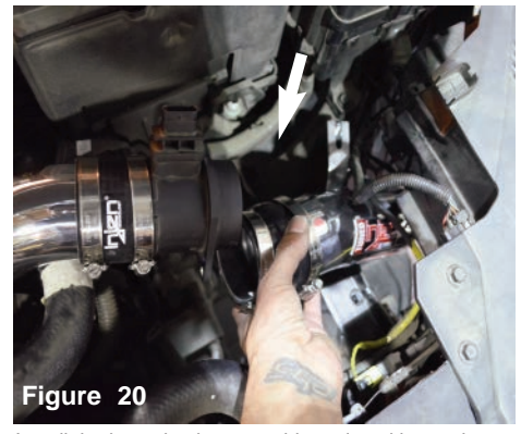
Install the lower intake assembly and position to the vibra mount and to the MAF sensor. Do Not Tighten.