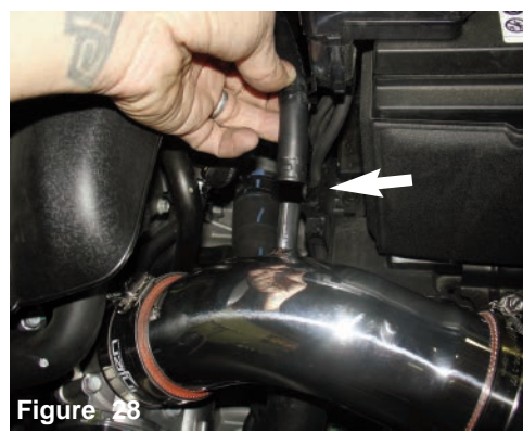
Now secure the crank case line to the fitting on the intake tube.