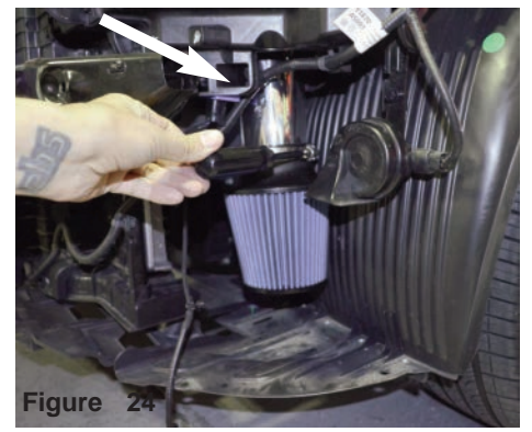
Using 8mm nut driver, tighten the clamp and secure.