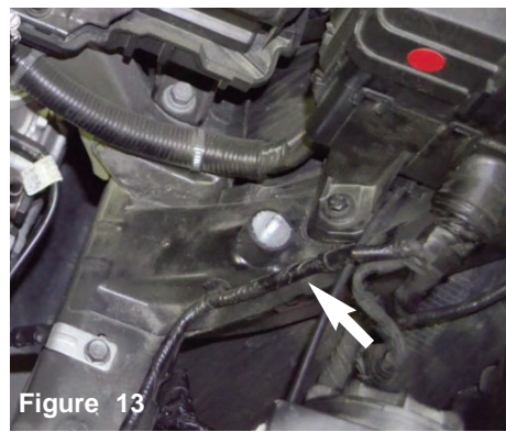
Install the vibra mount to thredded insert. Secure the vibra mount and tighten.