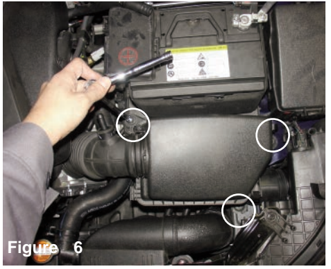
With 10mm socket and ratchet loosen the 3 screws holding in the air box assembly.