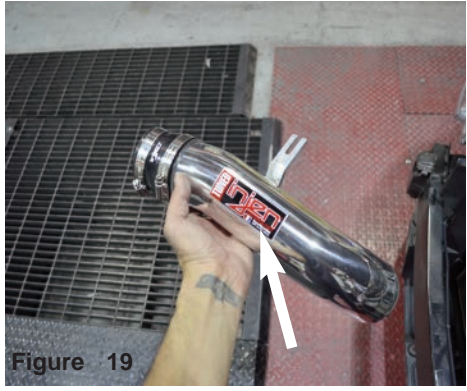
Install the 2.75"x3" step hose to the upper intake assembly with clamps. Do not tighten.