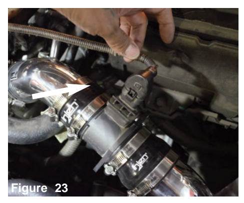
Connect MAF sensor.