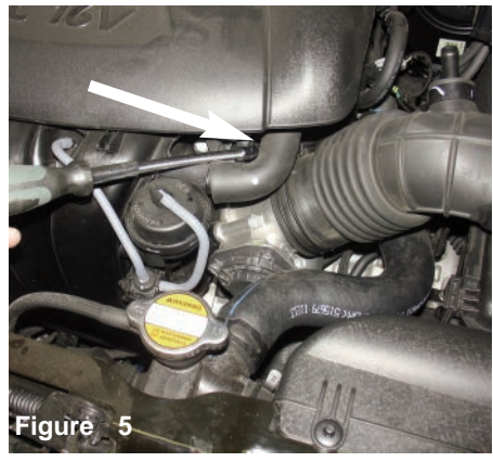
Now with a 10mm nut driver loosen the clamp on the throttle body.