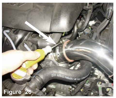
Position for best fit and tighten the remaining clamp on the throttle body using 8mm nut driver.