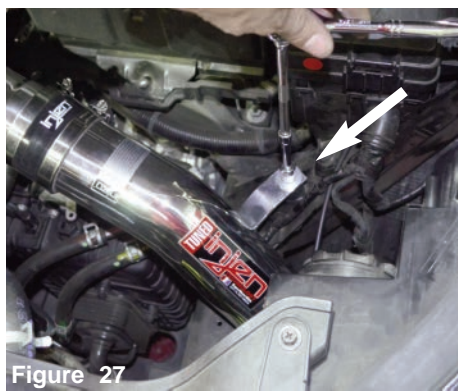
Now tighten the nut using 10mm socket and extension