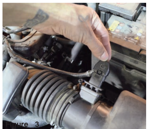
Disconnect the MAF sensor.