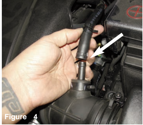
Now with pliers, loosen the clamp holding in crank case line and pull back.