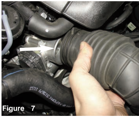
Now carefully pull back the intake hose from the throttle body.