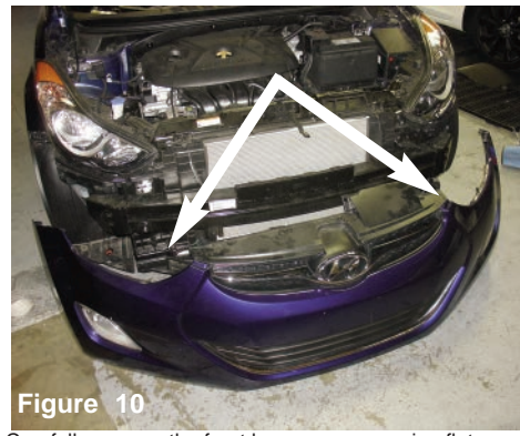
Carefully remove the front bumper cover, using flat head screwdriver and 8mm socket, carefully pull from corners out. Disconnect fog light harness. Search web for more info on removal of front bumper cover.