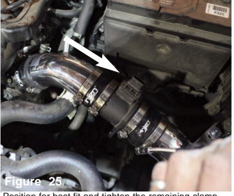
Position for best fit and tighten the remaining clamp using 8mm nut driver.