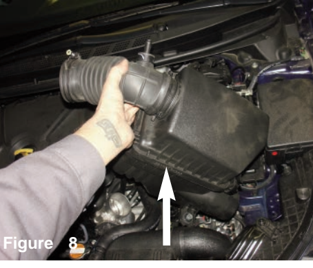
Now lift up and remove the stock intake assembly from the vehicle.