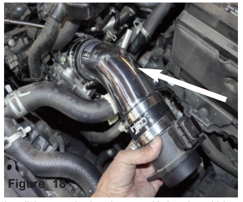
Install the upper intake tube assembly into the vehicle and position. Do Not Tighten.