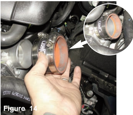
Install the 2-3/4" straight hose to the throttle body and secure using clamps provided and tighten on the throttle body only.