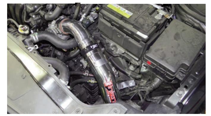
Congratulations! You have just completed the installation of the World's first tuned intake system, the Power-Flow intake, featuring MR Technology. Periodically, check the system for fitment, this will enhance the life of your Power-Flow system, failure to do so will void the warranty.