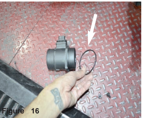
Remove the O ring from the MAF sensor.