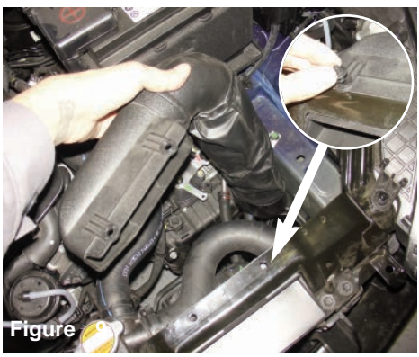
Remove the 2 push clips from the front of the radiator support holding in the ram scoop and remove.