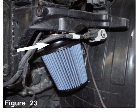
Install the filter to the intake tube.