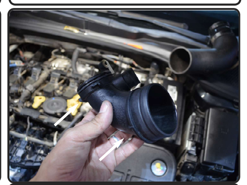
6. Once released from the turbo, carefully pull out and remove from the vehicle.