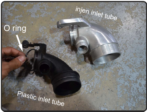
7. Now remove the OEM O ring from the plastic inlet tube.