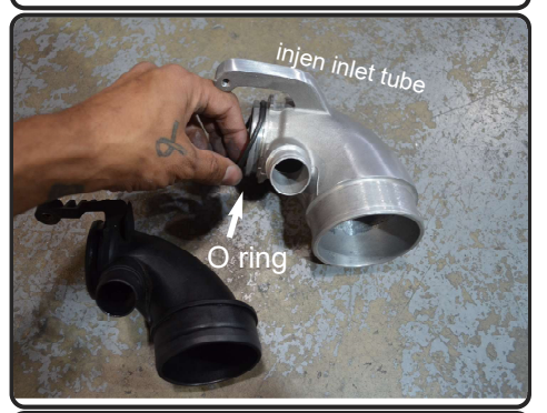
8. Now Re install the O ring to the cast injen inlet tube.