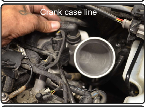
12. Re-connect the crank case line to the fitting on the injen inlet tube.