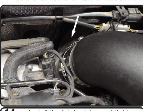
14. Install the intake tube and tighten all clamps using 8mm nut driver.

13. Install the provided 3" hump hose with clamps provided.