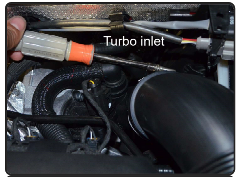
1. Stock inlet pipe shown. Remove the engine cover. Loosen all clamps on the intake tube and remove.