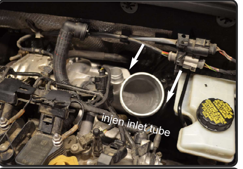
10. Once seated properly, rotate forward towards the front of engine.