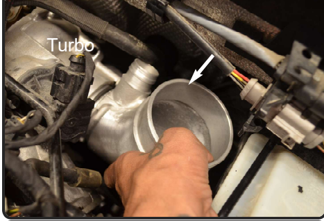
9. Install the injen inlet pipe. have pipe positioned towards the firewall