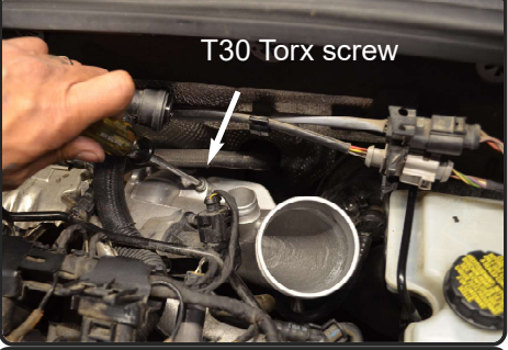
11. Secure the injen inlet tube using the original screw from step 4. Secure and tighten using T30 torx.