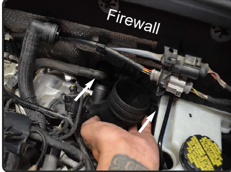
5. Rotate the inlet pipe towards the firewall.