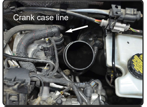
2. Once remove locate the crank case fitting.