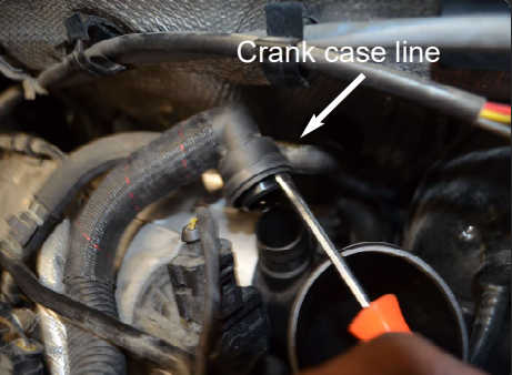
3. Disconnect the crank case line using flat head screw driver from under, possible to use 2 and push out.