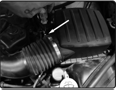
4. On the air box, loosen the clamp.