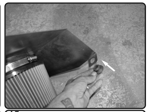
15. Install the grommet from step 9 to the lower tab with hole cut out on heatshield.