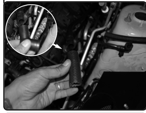
20. Remove the rubber elbow coupler from the crankcase plastic line. Install provided 15mm hose.