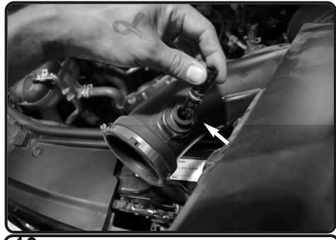
10. Turn and remove the temperature sensor out of the intake tube.