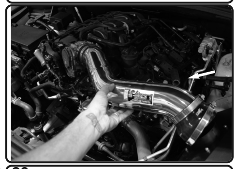
23. Install the step hose to the intake tube with clamps and slide back. Install the intake tube to the vehicle and position to straight hose and adaptor