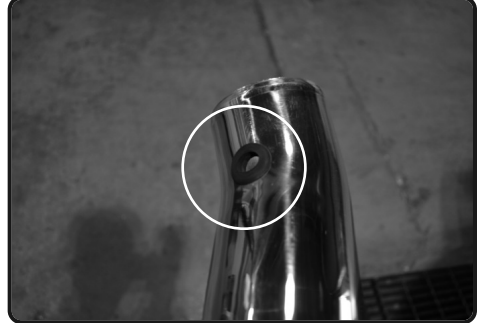
22. Install the provided rubber grommet to the hole on the intake tube.