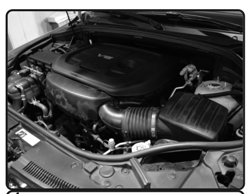
1. Stock intake system shown.