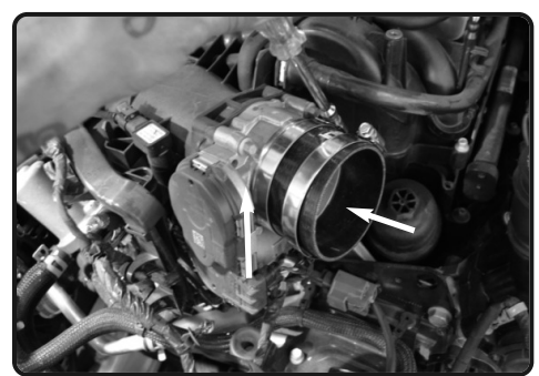
21. Install the provided straight hose with clamps to the throttle body.