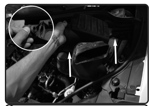
9. Lift up and remove the air box out of the vehicle. Remove 1 of the grommets on the bottom of airbox that will be used on the new heatshield.