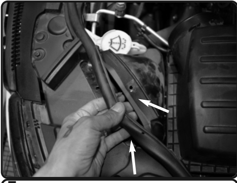
7. Carefully pull back the rubber hood line trim from the air box ram inlet.