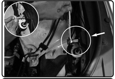
11. Loosen the bolt on the side of the fender compartment next to the hood push pin. Remove bolt and save for later install.