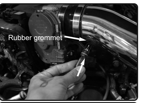
26. Install the temperature sensor to the grommet on intake tube and secure. Re-connect the harness.