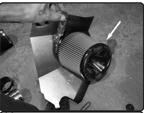
14. Install the air filter to the adaptor and secure using 8mm nut driver.