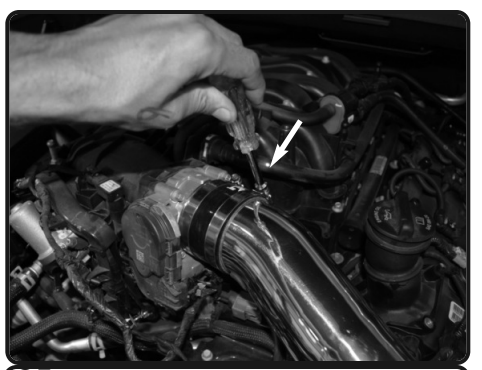
25. Secure and tighten clamp on throttle body.