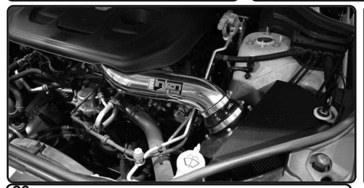
29. Check all fittings and clamps, and secure all screws. your installation is now complete.

Congratulations! You have just completed the installation of this intake system. Periodically, check the alignment of the intake, normal wear and tear can cause nuts and bolts to come loose. Note: Check clearance and adjust if needed! Failure to check the alignment and adjust the intake can cause damage that will void the warranty. Injen Technology is not responsible for any damages caused by/from improper installation.