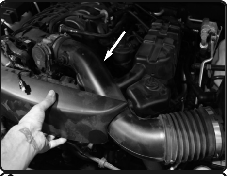
6. Remove the intake tube out of vehicle.