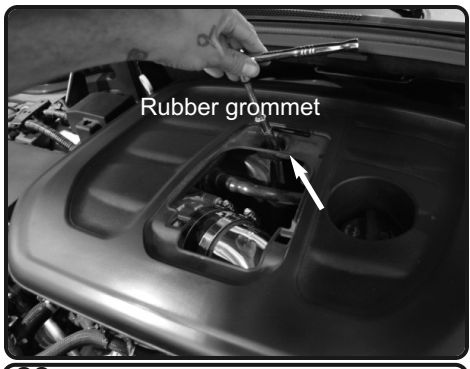
28. Install the engine cover and secure.