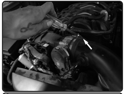
3. Loosen the clamp on the throttle body.