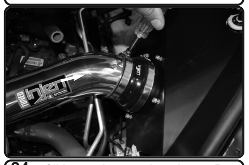
24. Slide step hose to the adaptor, Position for best fit. Secure and tighten.