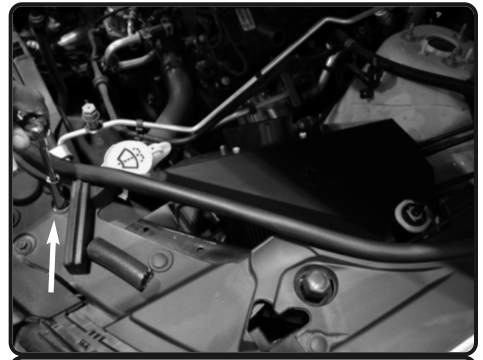
19. Re-install the bolt from step 12 ansd secure the heatshield tab under the plastic shroud cover.