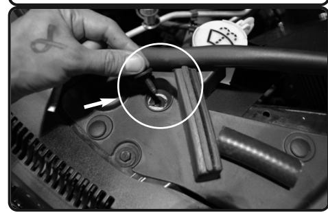
12. Loosen the 10mm bolt on the radiator support.