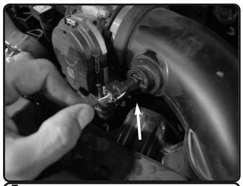
5. Disconnect the temperature sensor harness