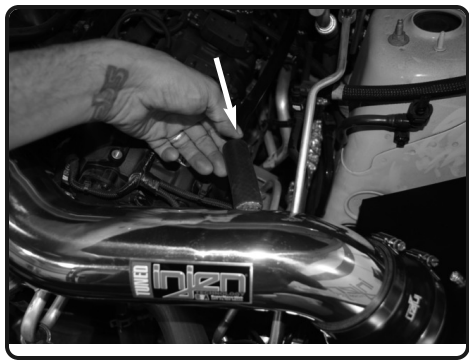
27. Connect the crank case line to the fitting on intake tube.