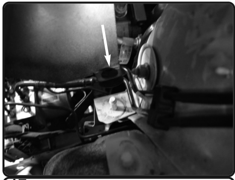
17. Make sure the heatshield on tab is seated on the OEM stud with grommet.