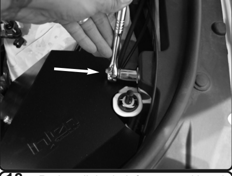
18. Re-install the bolt from step 11 and secure the heatshield.