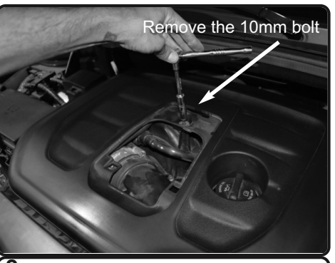
2. Loosen the cover cap and loosen the bolt holding in the engine cover. Lift up and remove the engine cover.