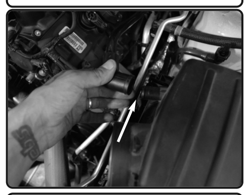
8. Pull back the crank case line from the air box.