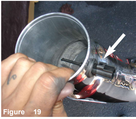
Install the temperature sensor into the intake tube and secure