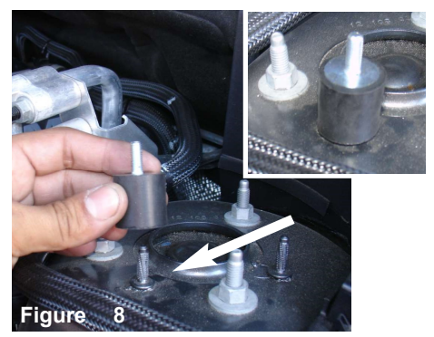
Locate the M6 thredded fitting on the strut tower and secure the male/female vibra mount.