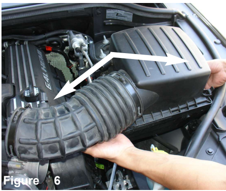
Remove the complete air box assembly out of the vehicle.