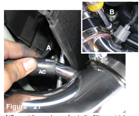
A)Connect the crank case line to the fitting on intake tube. B) Tighten the clamp on throttle body.