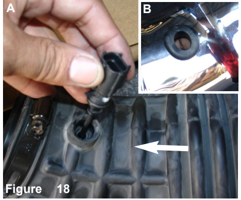
A) Remove the temp sensor from the stock intake tube. B) Install the temp sensor to the hole on intake tube.