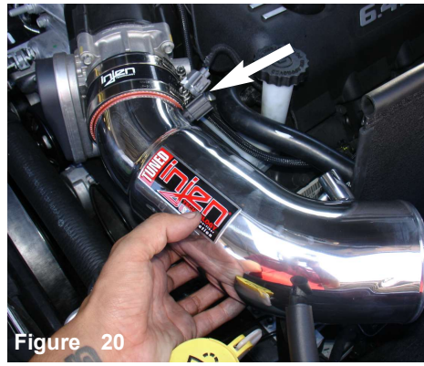
Install the intake tube into vehicle and position. Then reconnect the air temp sensor harness.