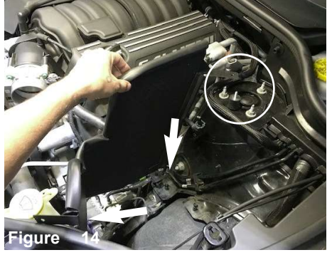
Install the heat shield assembly into the vehicle and position the heat shield brackets to the vibramounts. Then place the bracket with the OEM grommet onto the air box mounting tab on the shock tower