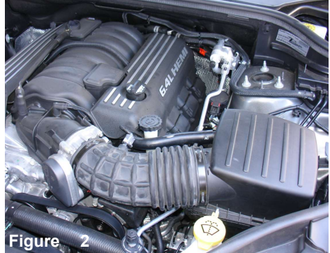
Complete stock air intake cleaner and air intake duct.