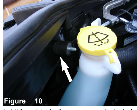
Install the male/male vibra-mount secure the back of the vibra-mount using provided m6 nut. You will have place the m6 nut on the back side of the frame in order to do this.