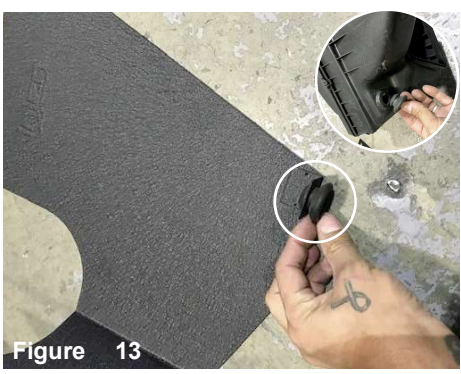
Remove one of the OEM rubber grommets from the stock air box and install into the tab on bottom of heat shield.