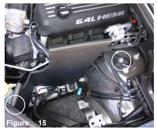
Secure the heat shield using provided M6 nuts and fender washers