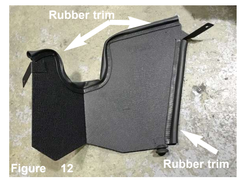
Install the rubber trim to the top of the heat shield. Install the smaller rubber trim to side of the heat shield.