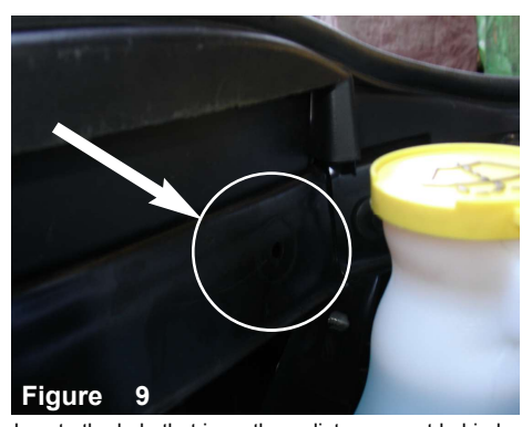
Locate the hole that is on the radiator support behind the washer reservoir filler. Some model may have a plastic push in rivet that will have to be removed to access this hole.