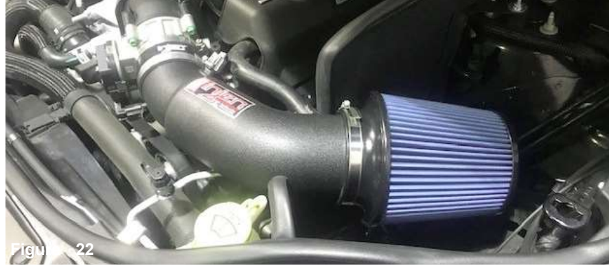
Install the air fitler and tighten using 8mm nut driver. Congratulations! You have just completed the installation of this intake system. Periodically, check the alignment of the intake, normal wear and tear can cause nuts and bolts to come loose. Note: Check clearance and adjust if needed! Failure to check the alignment and adjust the intake can cause damage that will void the warranty. Injen Technology is not responsible for any damages caused by/from improper installation.