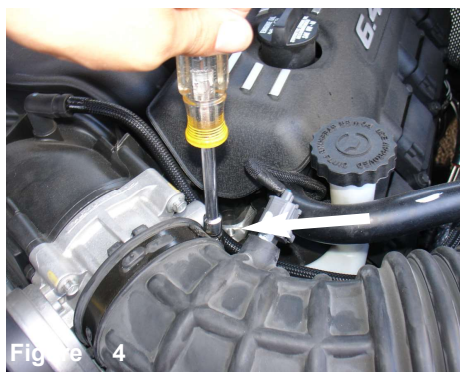
Loosen the clamp on the throttle body using 8mm nut driver.