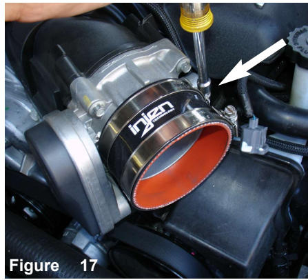
Install the straight hose with clamps to the throttle body. Tighten the clamp on throttle body using 8mm nut driver.