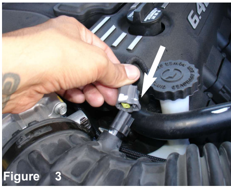
Disconnect the temperature sensor.