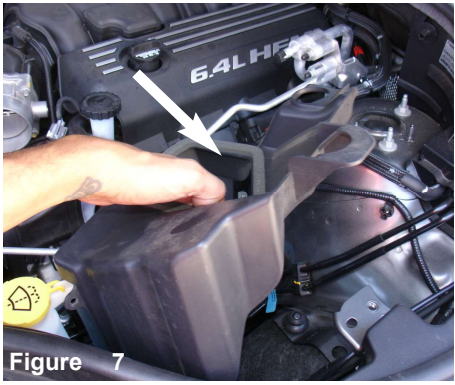
Remove the plastic air box splash guard.