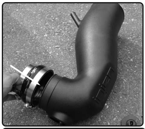
13. With provided Step hose and clamps install to the tube. Do not tighten.