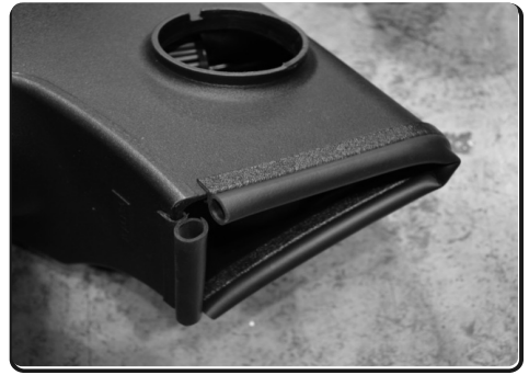
10. Install the provided bulb trims to the bottom of the airbox.