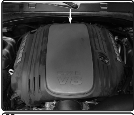
22. Re-install the engine cover.