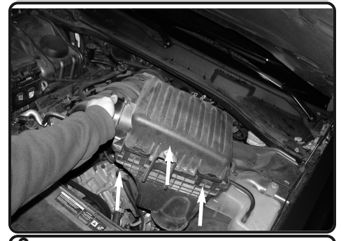
9. Lift up and remove entire factory air box.