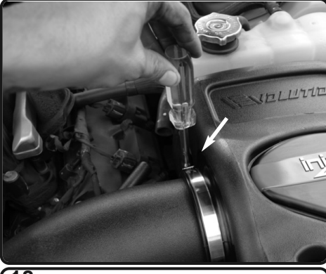
18. Secure the clamp on filter using 8mm nut driver.