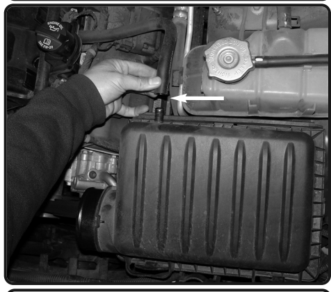
7. Pull back the crankcase line from the airbox fitting.