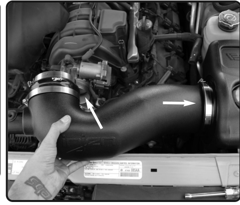
16. install the intake tube assembly into the vehicle and position.