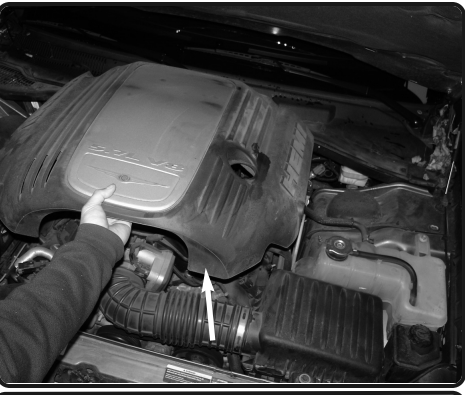
2 . Lift up and remove engine cover.