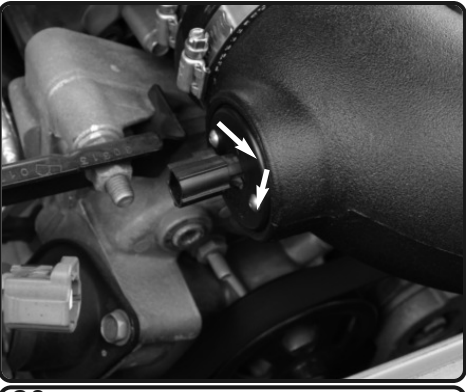
20. once seated, rotate the sensor and secure.