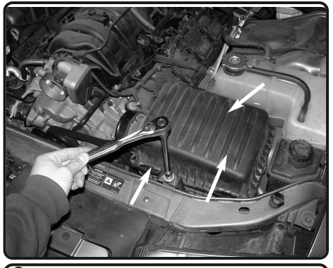
8. Use a 8mm socket with a 3/8 rachet and remove the 8mm bolt mounting the factory air box to the radiator support.