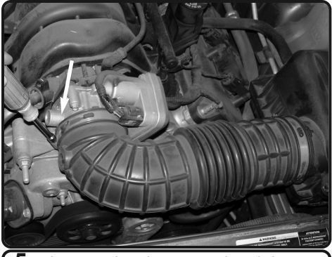
5. Loosen the clamps on the air box and throttle body using 8mm nut driver.