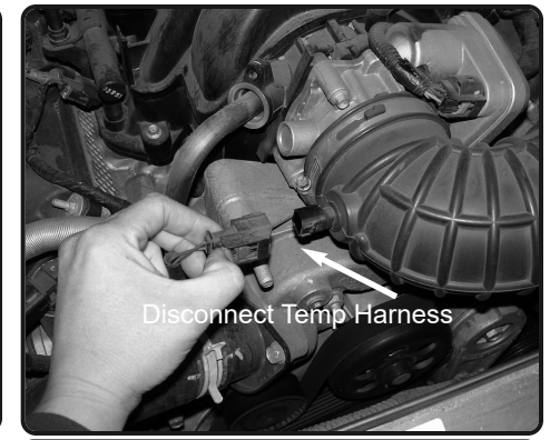
3. Once the engine cover is remove, disconnect the harness from the air temperature sensor.