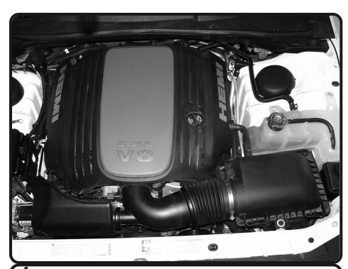
1. Stock air intake box and air intake duct shown above.