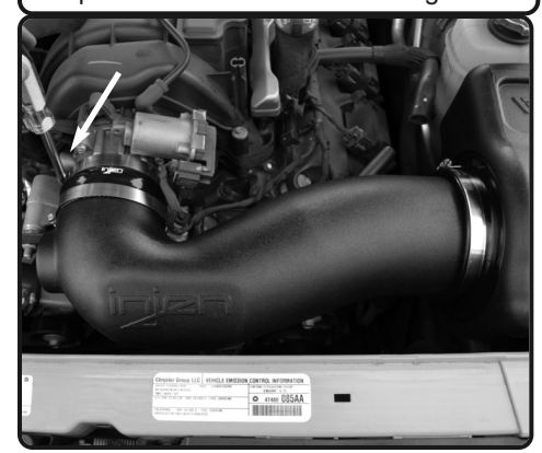
17. secure the tube and position for best fit. Tighten clamp on Throttle body.