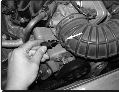
4. Firmly pull and remove air temperature sensor out of factory air duct.