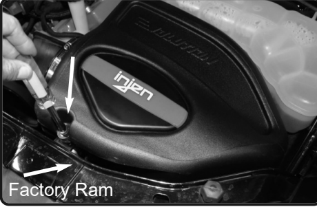
12. install the air box assembly into the vehicle. Secure using OEM screw. Make sure the nipple fitting on back side of injen airbox is seated in the OEM grommet on fender well.