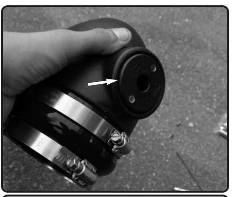
13. install the temp adaptor to the tube.