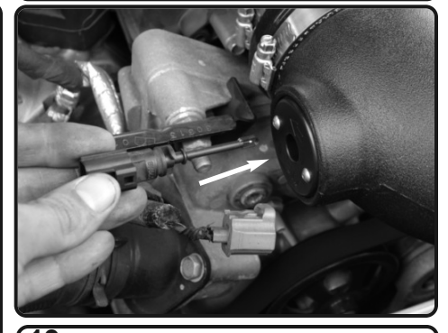
19. install the Temperature sensor into the adaptor. Re-connect the Harness.