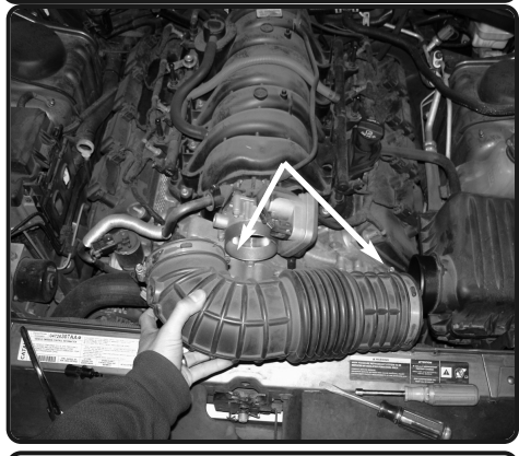
6. Remove the OEM intake tube out of the vehicle.