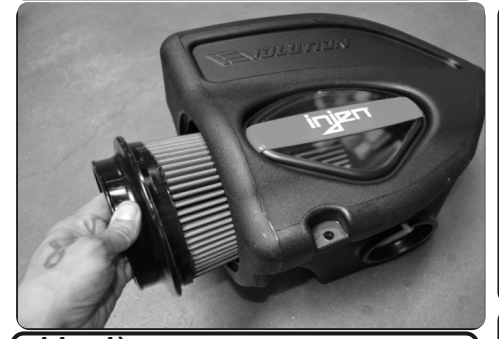
11. 1)Insert twist lock filter to the air box. 2)Once seated, rotate in either direction 1/4 turn till filter locks.