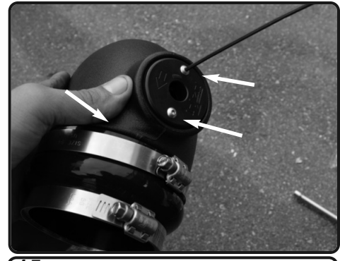
15. Secure the temp adaptor using the provided m4 button head screws. Tighten using 2.5mm allen key.