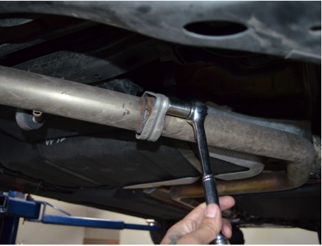
2. Remove the two nuts securing the mid pipe to the OEM muffler section.