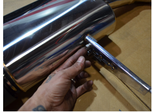
6. Secure the left and right hanger to the M8 x12mm bolts

5. Attach the provided tips to the Injen axle back exhaust. Do not fully secure until axle back exhaust using the provided the exaust is mounted on the vehicle.