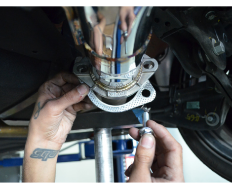
8. Place the provided gasket in between the axle back and mid pipe, then secure the axle back with the M10 bolts and nuts.