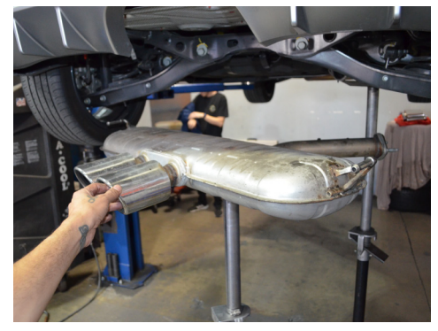
4. Remove the OEM muffler section from the vehicle.