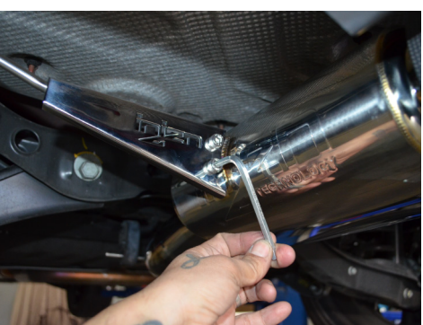
9. If needed, readjust both hanger brackets.