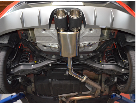
11. Ensure all bolts, nuts, and clamps are properly secured.