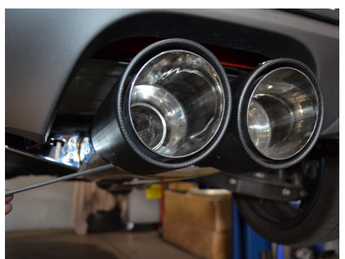
10. Adjust the exhaust tips to the desired location then secure the clamps.