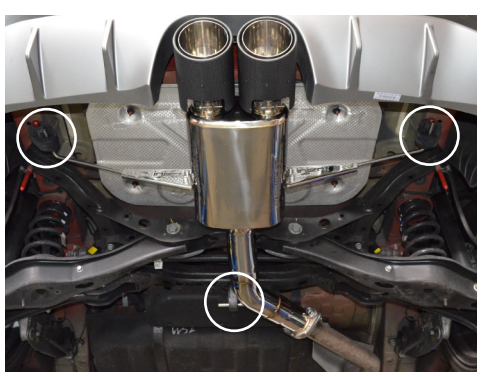
7. Install the axle back exhaust to the vehicle. Insert the three hangers to the rubber insulators.