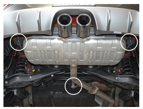
3. Detach the three hangers from the rubber insulators.