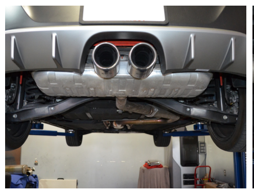
1. OEM exhaust system.