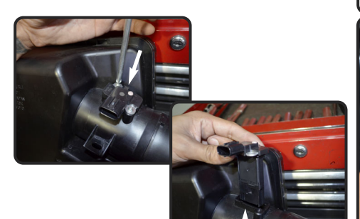
9. Loosen the 2 screws holding in the MAF sensor. Now lift up the MAF sensor and remove.