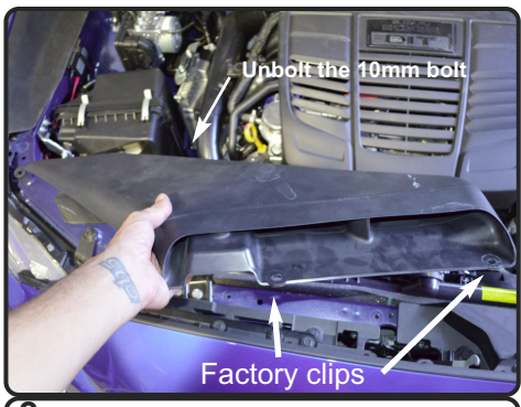
2. Remove the two plastic retaining rivets from the air scoop and remove scoop from engine bay. Save for later install. Loosen the 10mm bolt holding in the lower part of the air box to the vehicle frame.

1. Stock air box assembly shown in this picture. Disconnect battery before the install.