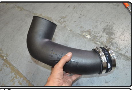
12. Now attach the 3.25 straight hose to the upper intake tube with clamps provided. Tighten the clamp on upper intake tube only.