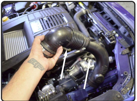
6. Remove the OEM vibramount from vehicle! Now lift up and remove the stock intake tube from the vehicle.

5. Loosen the clamp on the turbo intake tube. With 10mm socket, loosen the bracket on intake tube from OEM vibramount. loosen the backside of the vibramount.