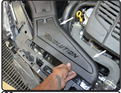
26. Install the scoop to the intake system and attach to the inside of the air box.