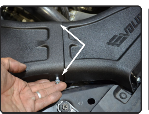
27. Secure the scoop to the airbox using provided M6 socket cap screws. Tighten using allen key.