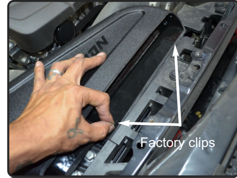
28. Re-install the factory retaining rivets from step 2. to the injen scoop and secure. Re-install bumper cover and Re-connect Battery.