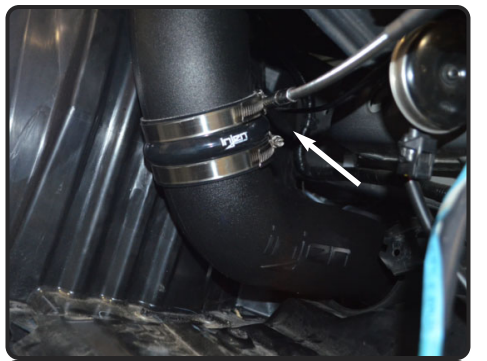
25. Now secure and tighten all clamps on the intake system using 8mm nut driver.