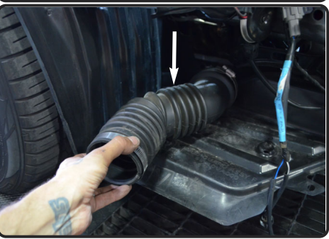
8. loosen clamp on the turbo and remove the lower intake tube.

7. Loosen and remove the front bumper cover for the installation of the injen intake system.