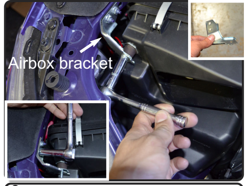
3. With 10mm socket and ratchet, loosen the nut holding in the airbox bracket. Loosen the 2 nuts holding in the airbox bracket and remove. Save air box bracket and oem isolation mount for later install.