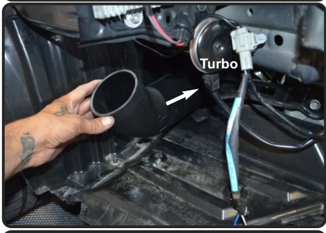
11. Install the lower intake tube and attach to the 3" hump hose and position. Do not tighten.

10. Install the provided 3" hump hose with clamps provided to the turbo. Tighten the clamp on turbo side only.