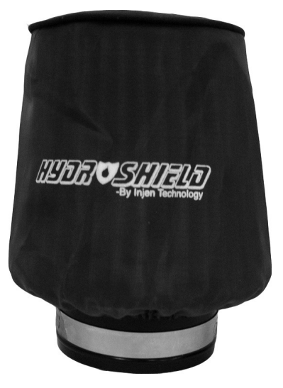
Hydro Shield Sold Separately