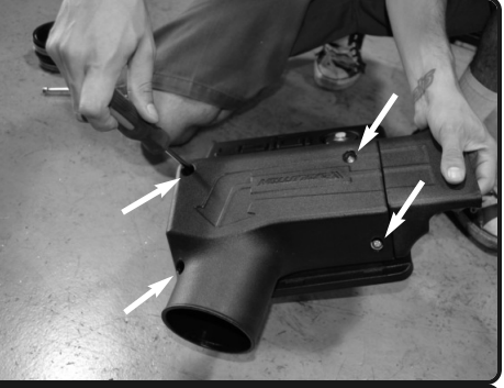
8. Use 4-M6X30 screws to secure the plenum to the Injen upper air box.

7. Once the Filter Minder plug is installed in the upper air box, install the filter onto the Injen air box plenum.