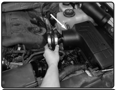
12. Place the 4.00" hump hose and 2-#64 clamps onto the Injen intake plenum. Make sure you push the hump hose all the way over to allow room for the intake tube.