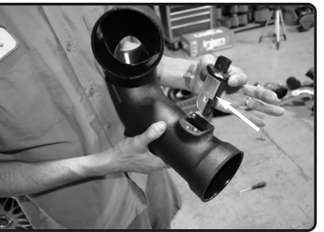
10. Place the MAF sensor into the Injen intake tube and secure it with the two M4 supplied screws.

9. Install the Injen upper airbox and plenum onto the lower OEM airbox assembly and attach the 3 factory metal clips to secure the Injen air box to the OEM air box