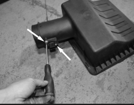
3. Remove the two torq screws and remove the MAF sensor from the upper air box assembly