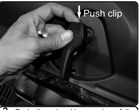
2. Push clip on hood lever and carefully remove the lever out of vehicle.