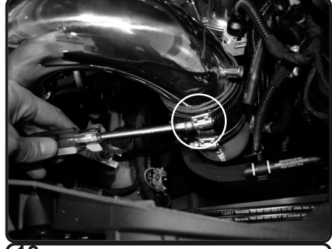
18. Secure the hose and tighten clamps using 8mm nut driver.