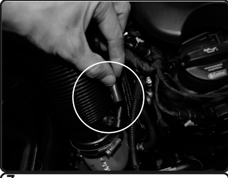
7. Pull back the vacuum line from the OEM intake tube.