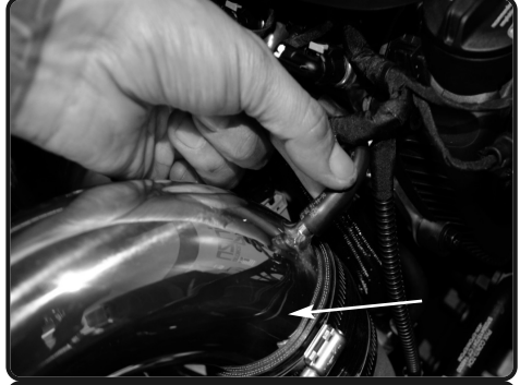
19. Connect the vacuum line to the fitting on the intake tube.