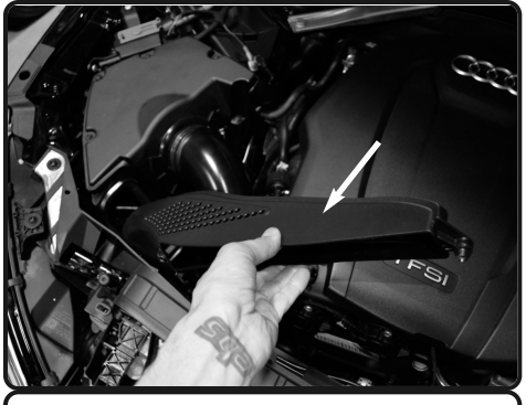
6. Remove the ram scoop from vehicle.