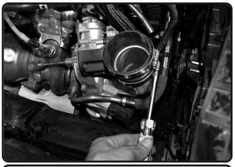
12. Tighten the clamp on turbo only.