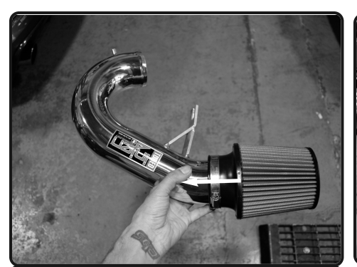
13. Install the filter to the tube.