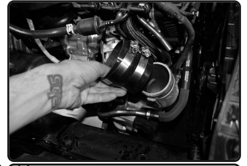
11. Install the provided step hose with clamps provided to turbo.