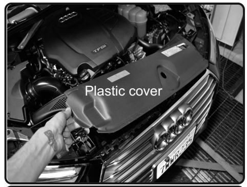
3. Now remove the plastic cover.