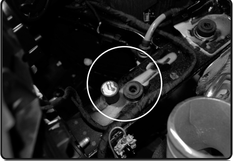
10. Now install the provided female/male M6 vibramount to the thredded stud on ve-hicle frame. Secure and tighten.