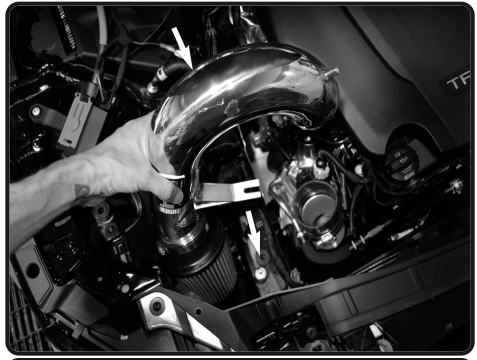
15. Install the intake assembly into the vehicle.