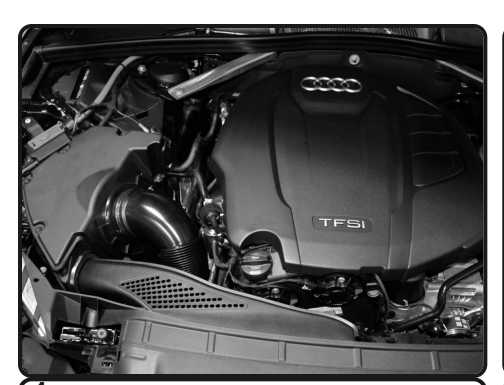
1. Stock intake system shown.