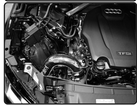
20. Verify all components are tight. Re-install the front plastic cover.