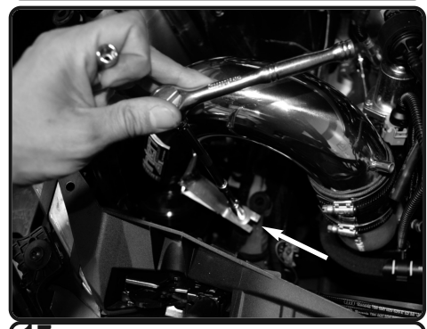
17. Tighten bracket using 10mm socket or wrench.