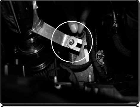
16. Now position the intake tube. Position the bracket to the vibramount secure using provided M6 nut and fender washer.