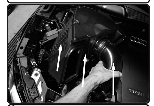
9. Carefully lift up and remove the en-tire air box assembly out of vehicle.