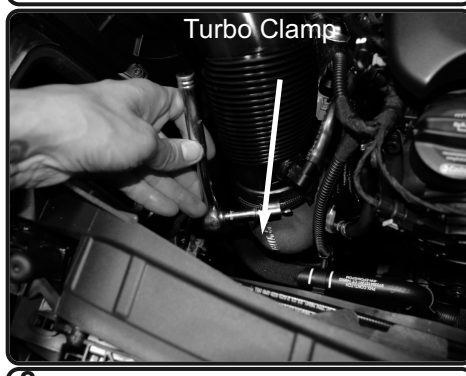
8. Loosen the clamp on the turbo using 7mm socket with ratchet.