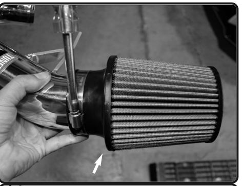
14. Secure and tighten using 8mm nut