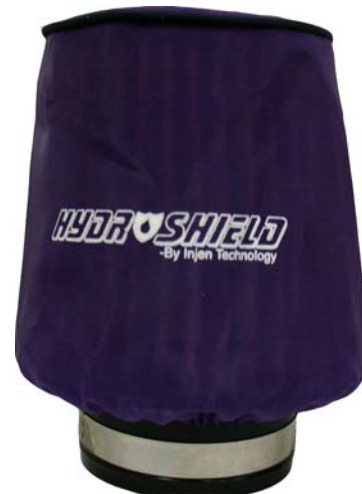
Hydro Shield Sold Separately

Now available, Hydro Shield by Injen Part Number X-1033