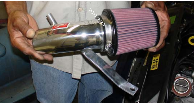
Press the dyno-tuned filter over the swaged end of the intake. Press the filter until it butts up to the stops located inside of the filter.