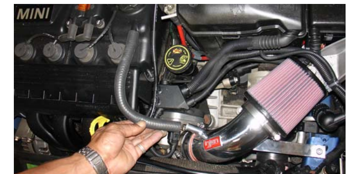
Once the intake has been align for best possible fitment, take the 12mm heat hose and press one end over the crankcase port.