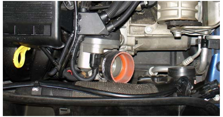
Take the short 2 1/2" x 2 3/4" step hose and press the 2 1/2" end over the throttle body. Use one medium clamp and one small clamp. Tighten the clamp on the throttle body side at this point.