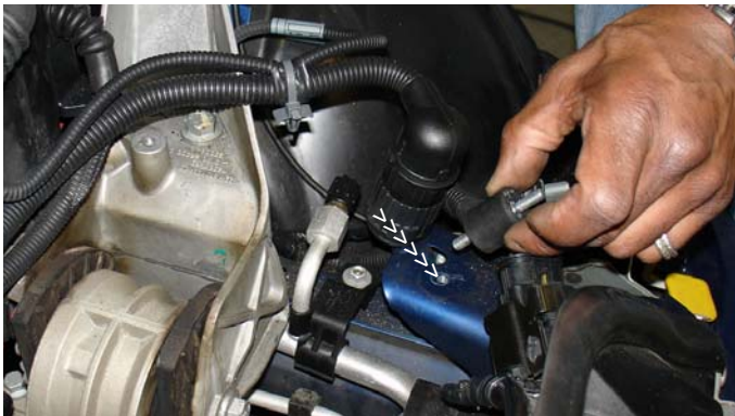
Locate the vibra-mount and screw it into the pre-tapped hole used to secure the stock air intake box.