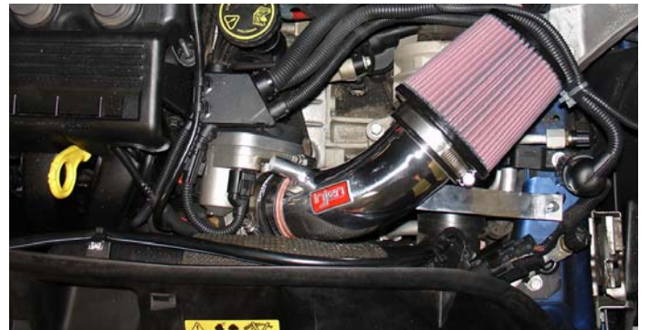
Position the assembled intake and filter into the step hose located on the throttle body. Align the intake for best possible fit. While the intake is positioned, place the bracket on the intake over the vibra-mount stud.