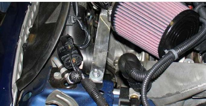
Take the flange nut and fender washer and secure the entire intake to the vibra-mount.