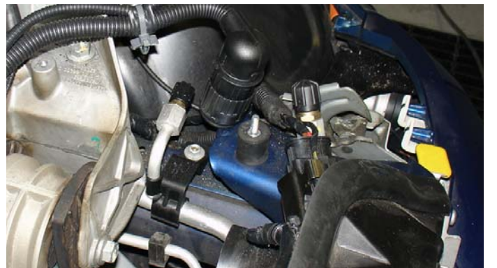
Screw the vibra-mount into the brace until it bottoms out.