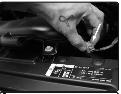
2. Carefully disconnect the temperature sensor, pull back the harness from the intake tube.