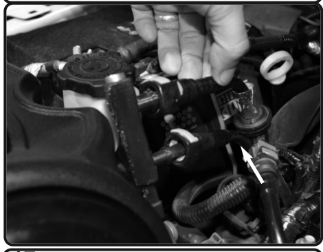
17. Make sure the harness on the vacuum lines are secured and you hear the click. Tug and pull back to verify the're connected.