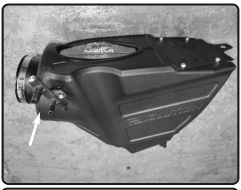
14. Air box assembly ready to be installed into the vehicle.