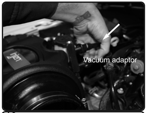
16. Connect the vacuum lines to the vacuum adaptor on the airbox.