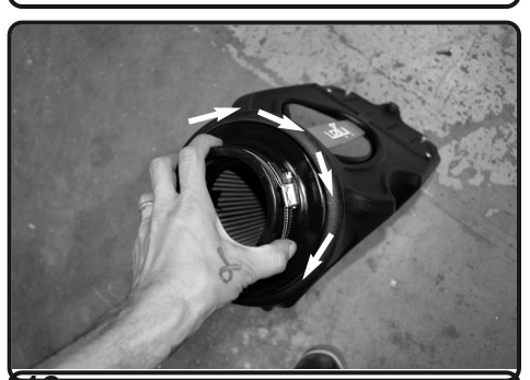
12. Once the twist lock filter is seated properly, rotate the filter in either direction a 1/4" turn untill filter locks into place.