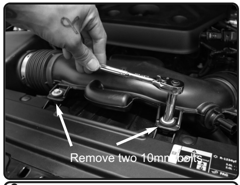
3. Loosen the 2 bolts holding in the intake tube and remove.