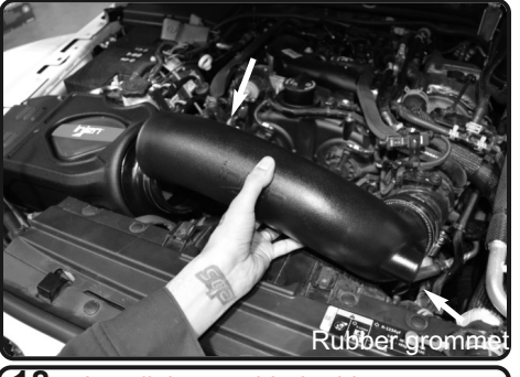
18. Install the provided rubber grommmet to the intake tube hole. Insert the Injen intake tube into the vehicle. Position tube to the filter and turbo inlet. Postion for best fit.