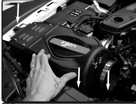
15. Install the airbox assembly into the vehicle. install into the factory position. Secure using the OEM screw from step 4.