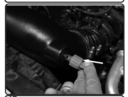
17. Install the air temp sensor to the rubber grommet on intake tube and reconnect the harness.