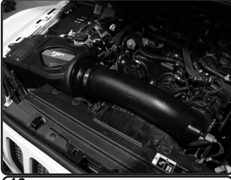
19. Your injen Evolution intake system is now complete.