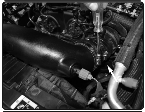
20. Secure and tighten all the clamps on the intake tube using 8mm nut driver.