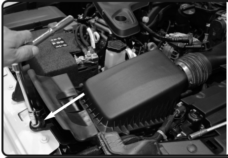
4. On the air box, loosen the bolt holding in the airbox. Loosen bolt and save for later install along with the grommet and crush washer.