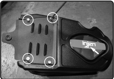
10. Secure the bracket to the air box using M6 socket cap screws. Secure and tighten using allen key.