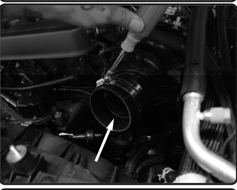
8. Install the provided step hump hose to the throttle body. Secure using provided clamps.