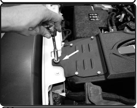
18. Once secured, tighten the bracket using 10mm socket or wrench.