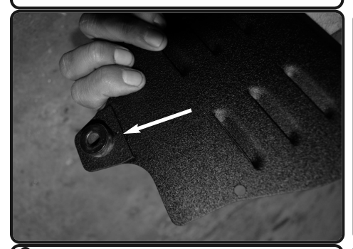
9. From step 4, install the grommet with crush washer to the hole on the airbox bracket cover.