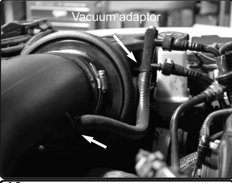
19. Connect the provided 10mm hose to the vacuum adaptor and to the brass barbed fitting on the intake tube. Adjust to desired position.