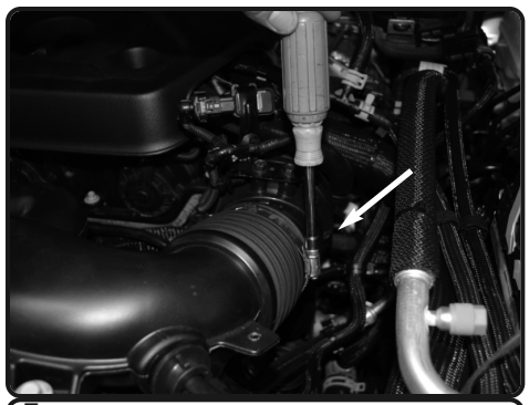
5. Loosen the clamp on the turbo inlet and pull back the intake tube from the turbo inlet.