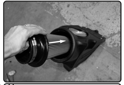
11. Install the twist lock filter into the airbox and secure.