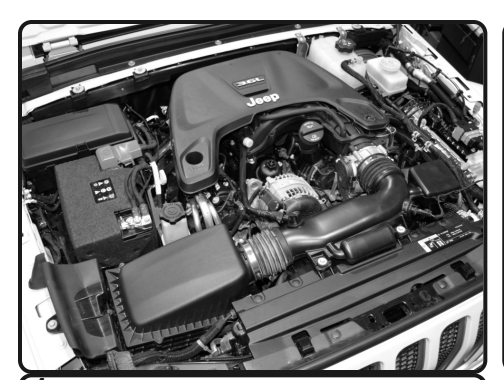
1. Stock intake system shown.