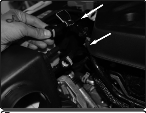
7. Disconnect both vacuum lines from the airbox