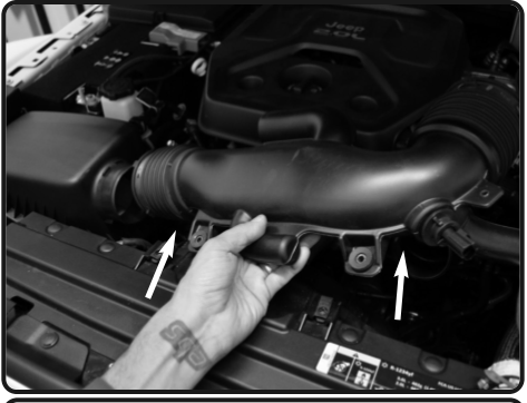
6. Lift up and remove the stock intake system out of the vehicle with air box..