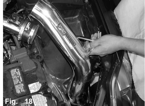
Carefully, lower the secondary intake into the resonator opening and into the bumper corner.