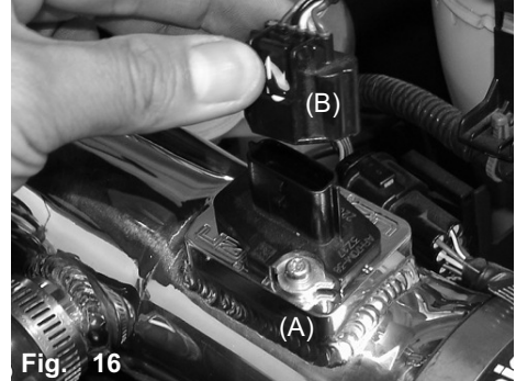
Use the stock screws to secure MAF sensor to the MAF sensor adapter (A). Insert MAF sensor harness plug over the sensor clip as shown above (B).