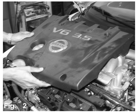
Remove the four m6 bolts that secure the engine cover over the intake manifold. Once all bolts have been removed, continue to remove the engine cover.