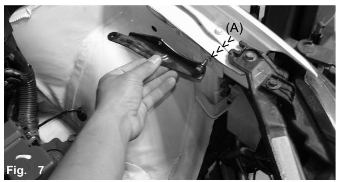
The bracket used to hold the stock air box in place will no longer be used. Remove the stock bracket to make room for the m6 vibra-mount. New location for the vibra-mount (A).