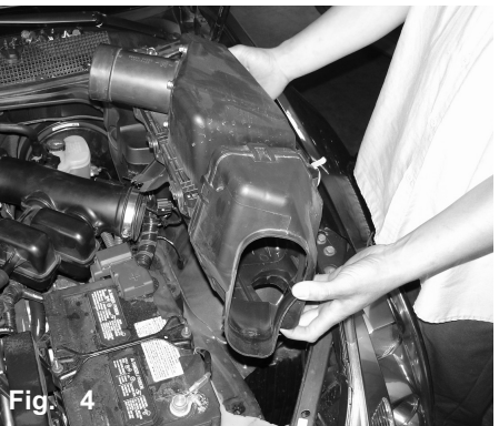
Loosen clamps and remove bolts from the stock air intake box cleaner in order to remove the entire air cleaning assembly.