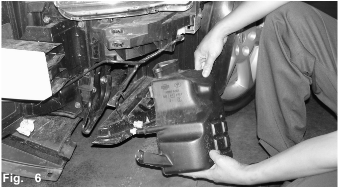
Once the bumper has been removed continue to disconnect and remove the plastic air intake resonator box.