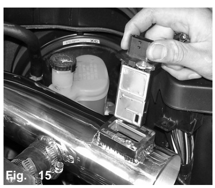
Take the MAF sensor and insert it into the machined MAF sensor adapter.