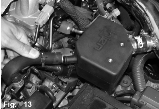
Press the stock breather hose over the open \mathsf{CCV}\, box port as shown above.