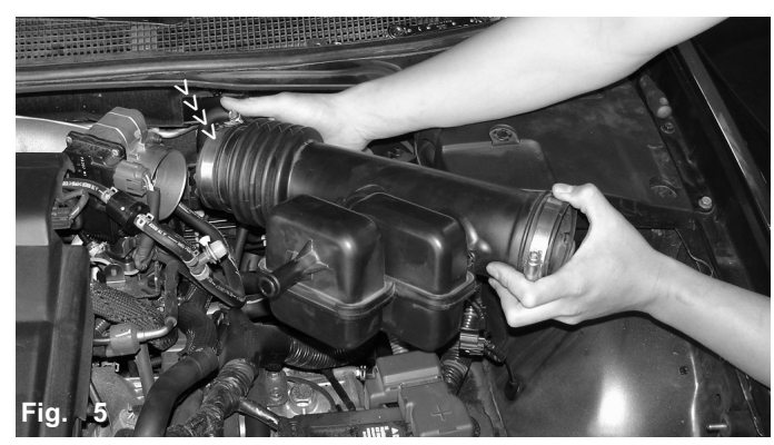
Loosen clamp at the throttle body and remove the air intake duct. At this point, it will be necessary to remove the front bumper. Remove 9 clips on top of the bumper, two 10mm screws on each side of the bumper, four additional sheet screws and 5 plastic clips.