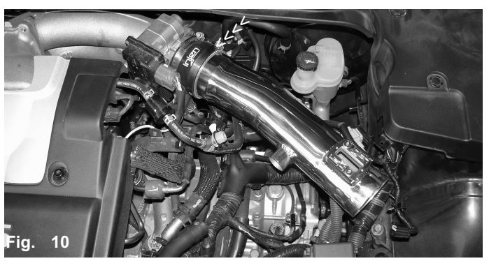
Insert the top end of the intake into the throttle body hose. Semi-tighten the other power-band just enough to hold the intake in place.