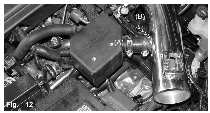
Press the assembled CCV box over the large intake port as shown above (A). Adjust entire CCV box and the tighten mini-band on the intake port (B).