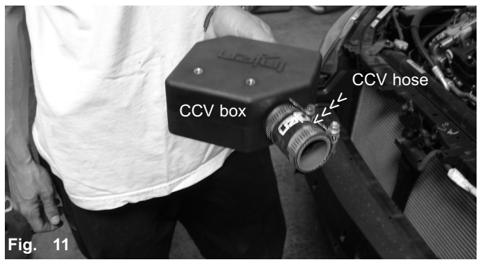
Insert the 1 1/8" CCV hose over the CCV box large port. Use the mini-bands to secure the hose in place, tighten the band on the CCV box port at this time.