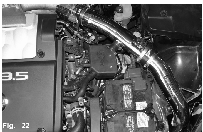
Press the 3 1/2" filter over the end of the secondary intake and tighten the clamp on the filter neck.

Congratulations! You have just completed the installation of The World's First Tuned Intake. Periodically, check the cold air for fitment in order to avoid any damage to your intake.