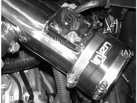
Press the 3" straight hose over the end of intake and tighten band located on the intake side. The second band is not tightened yet (A).