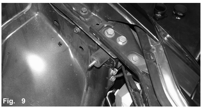
Take the vibra-mount and screw it into fender wall. Turn the vibra-mount into the fender wall until it bottoms out.