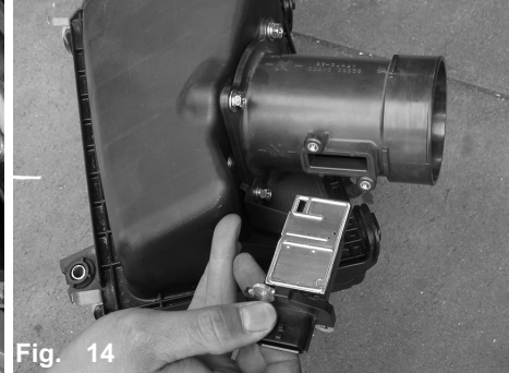
Use the torx bit in this kit to unbolt screws from the MAF sensor. Carefully, remove the MAF sensor from MAF sensor housing.