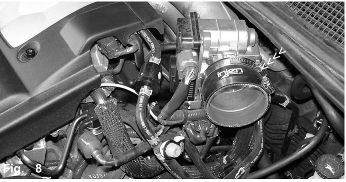
Press the 3 1/8" straight hose over the throttle body and use two .362 powerbands on the hose. Tighten the band located over the throttle body at this point.