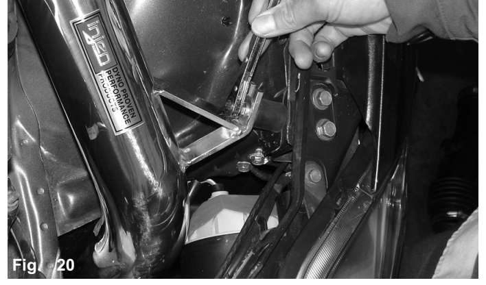
Align entire assembled intake and use a Ratchet or nut driver to tighten the m6 flange nut to the vibra-mount.