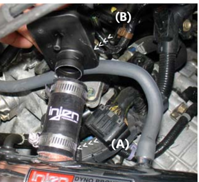
Once the CCV hose has been positioned correctly, continue to tighten the lower clamp(A). Now press the CCV box over and into the CCV hose as shown above (B).