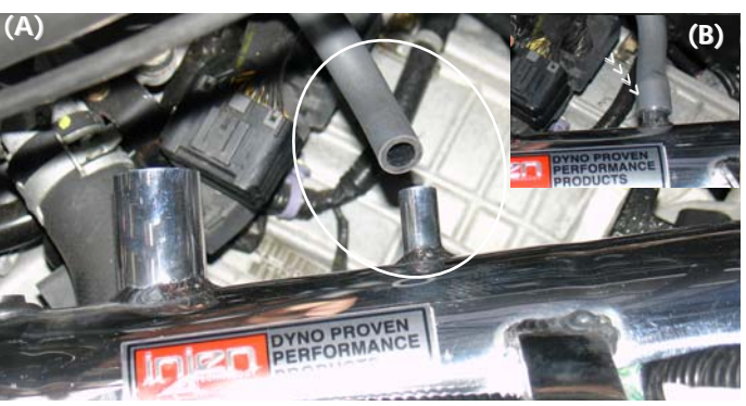
Insert the stock 8mm hose over the 3/8" intake port (A). Press the breather line just enough to hold itself in place (B).