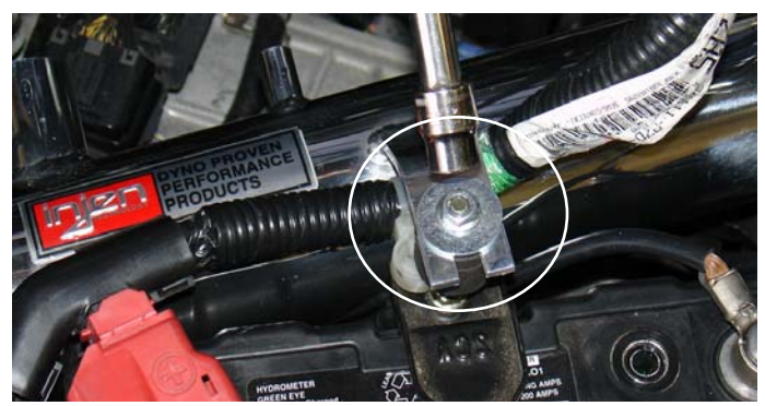
Place the m6 flange nut and fender washer over the intake bracket and vibramount stud. Take the m8 socket and Ratchet and semi-tighten the flange nut for