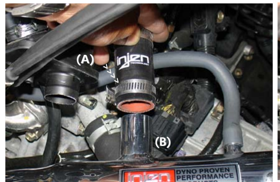
Take the 1 1/8" ID CCV hose, place two mini-clamps on each end of the CCV hose as shown above (A). Press the CCV hose over the large intake port as shown above.