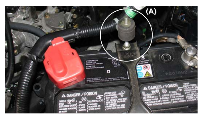
Screw the female vibra-mount over the battery post (A), Usually, 8 complete turns will be enough to level the intake bracket.