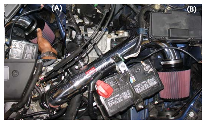
For short ram installation- Take the Injen filter and press it over the end of the intake (A). Once the filter has been properly installed continue to tighten the filter neck clamp (B).