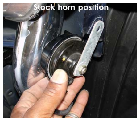
The stock horn is removed from its stock location and is turned around to keep intake from rattling.