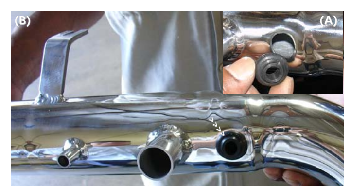
Take the 1525 sensor grommet at place it into the 3/4" pre-drilled hole (A). The sensor grommet groove will fit snug around the 3/4" holes edge (B).