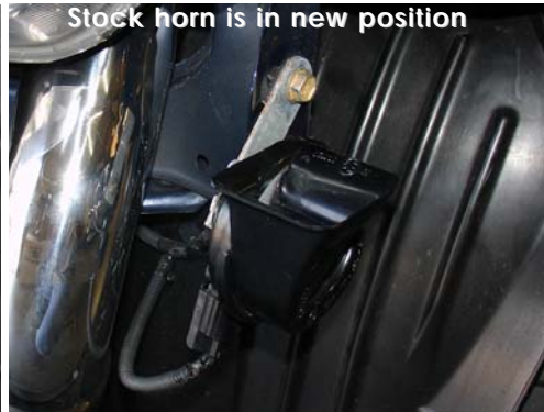
The screw is tightened into the bumper frame and the horn is now relocated.