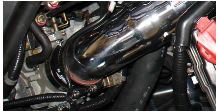
Press the intake throttle body side into the 2 3/4" hose. Align the intake bracket to the vibra-mount stud. Once the bracket has been aligned continue to semi-tighten the Power-band on the intake.