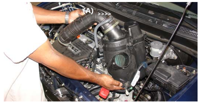
Loosen clamps and bolts in order to remove the air intake duct and air intake box from the engine compartment. Prior to pulling the air box out, remove the 8mm breather hose (A).