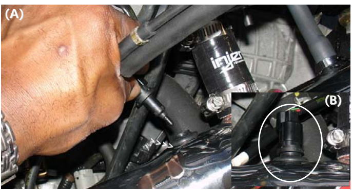
Press the air temperature sensor in to the 1525 sensor grommet (A). Insert the air temperature sensor into the grommet until it bottoms out (B).