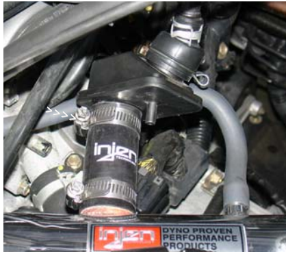
Once the CCV box has been correctly installed continue to tighten the mini-clamp.