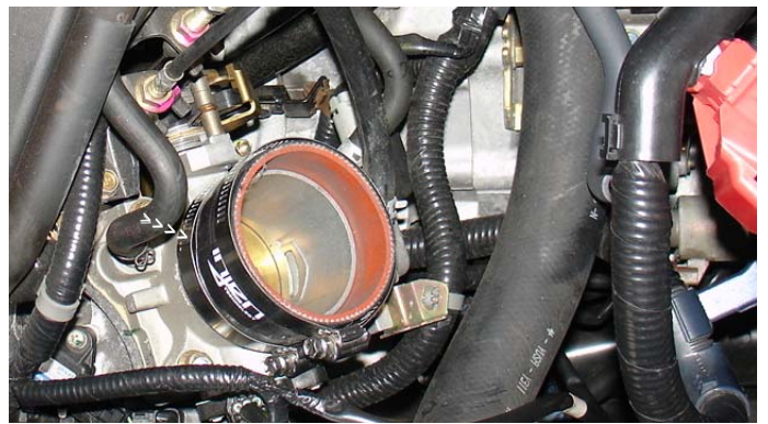
Press the 2 3/4" straight hose over the throttle body, place two Power-bands over the hose and tighten the hose on the throttle body side.