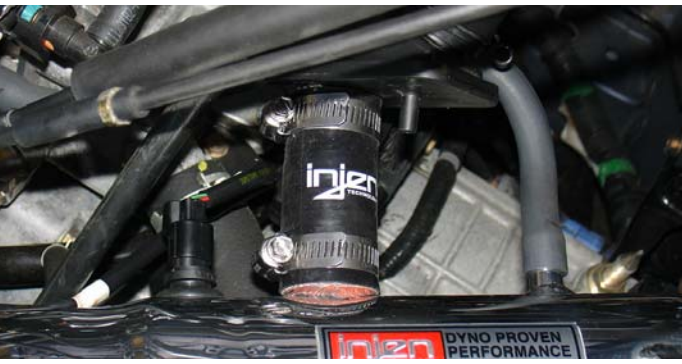
Here, the air temperature sensor, CCV hose, CCV box, and breather lines have been installed and completed.