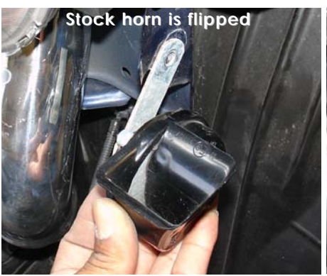
Turn the horn around so that it faces outward. Position the horn in place and screw the bolt back into the bumper frame.