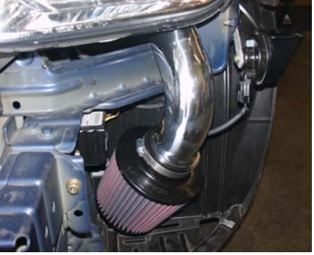
Locate the secondary intake and insert it into the bumper area via the engine compartment between the battery and front cross member