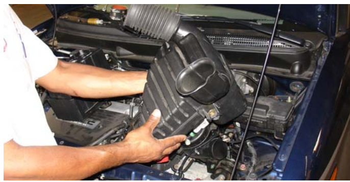
Note: For this installation, it will be required to remove the front bumper. Once the bumper has been removed continue to remove the stock air intake resonator from the bumper area.