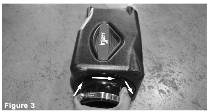
Once the filter is seated correctly and flat, rotate the filter 1/4" turn in either direction left or right and secure. Filter has built in lock.