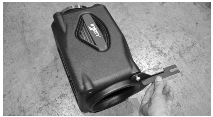
The bracket holes are lined up to the bolt pattern and the two M6 button head screws are used to secure bracket to air box. The bracket is now secured to the Power box.