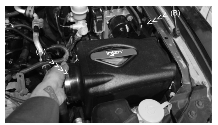
The assembled Power box is lowered into the engine compartment. The 4 inch hose is pressed over the end of the intake (A) and the Power box bracket is lined up to the vibra-mount stud (B).