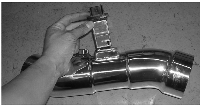
Insert the mass air sensor into the machined flange welded on the intake. Once the sensor has been firmly pressed into the flange, use stock screws to secure the sensor in place.