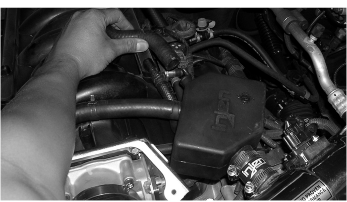
Locate the driver side breather hose and press it over the CCV box port as shown in this picture.