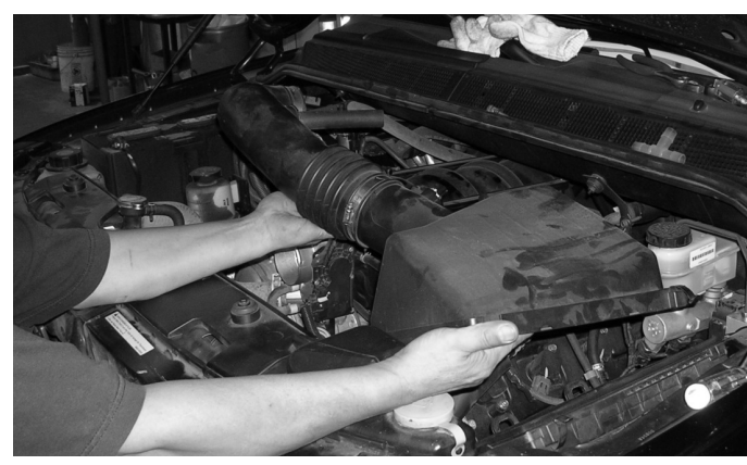
Remove screws, loosen clamps and remove upper air intake box and air intake duct connected to the throttle body.