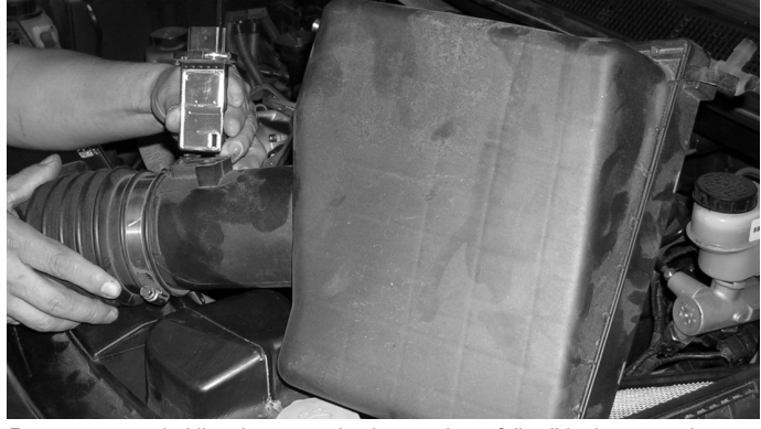
Remove screws holding the sensor in place and carefully slide the mass air sensor out of the sensor pad located on the air box outlet.