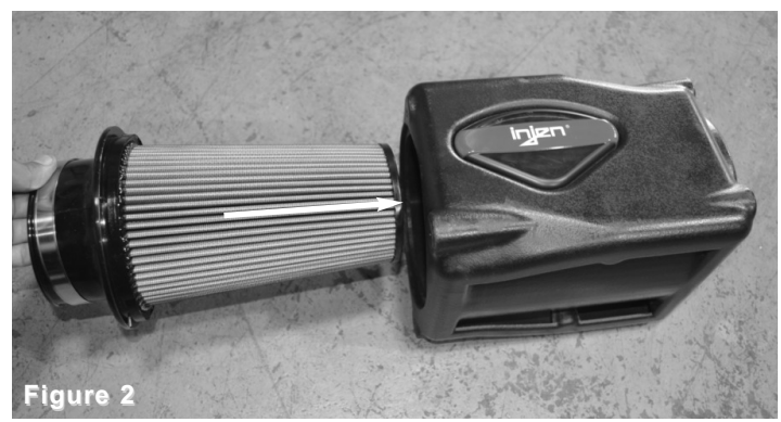
Install the provided Twist lock filter into the PowerFlow box.