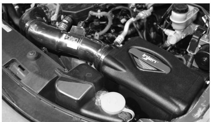
Congratulations! You have just completed the installation of the World's first tuned intake system, the Power-Flow intake, featuring MR Technology. Periodically, check the system for fitment, this will enhance the life of your Power-Flow system.