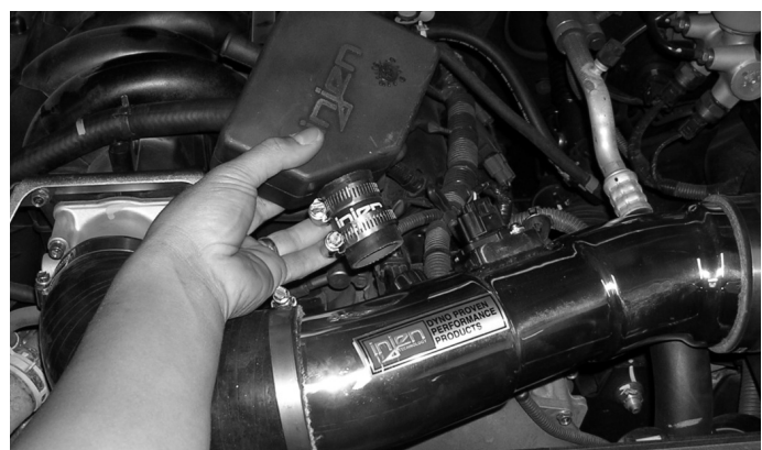
Take the assembled CCV box and press over the large port located on the