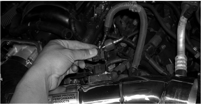
Take the harness clip and re-attach it to the air mass sensor until it snaps in place.