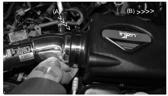
The Power box velocity stack base is connected to the intake (A) and the Power box bracket is lined up to the vibra-mount stud (B).