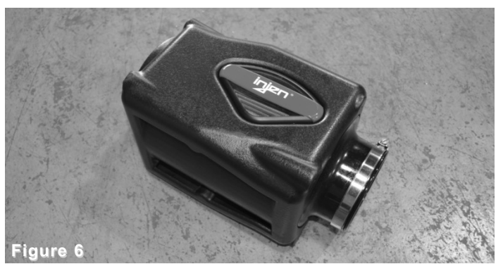
Above is the Passenger side orientation.

NOTE:Verify your filter before any cleaning maintenance! Blue media filter: Dry Air Filter, no oil required. (SuperNano Web Dry filters require no oil, these can be cleaned using a vacuum or light compressed air. Please do not clean using water or injen restore kit.) Red media filter: Factory Oiled Air Filter. (Oiled cotton gauze filters require oil, please use injen restore kit. This filter can use water or cleaning solution for