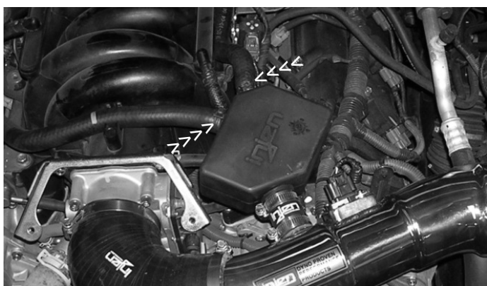
The driver and passenger side crank case breather lines are now connected to the CCV box.