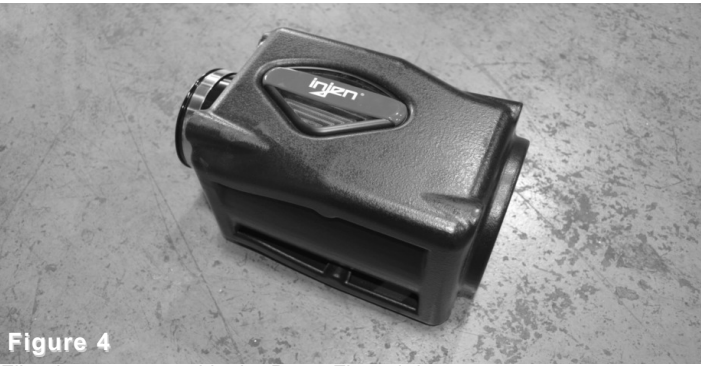
Filter is now secured in the PowerFlow air box.