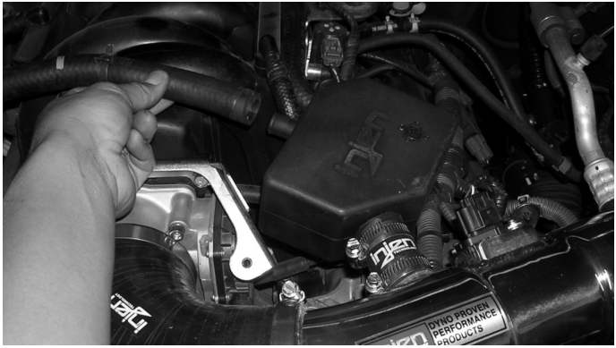
Locate the passenger side breather hose and press it over the CCV box port as shown in this picture.