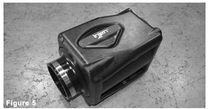
Above is the Driver side orientation.