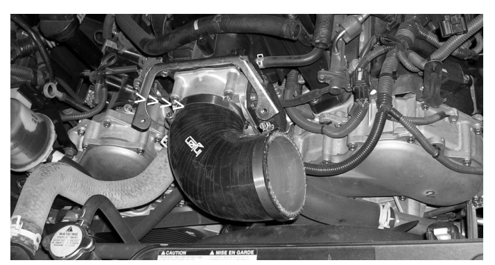
Place one large (.056) clamp over the end on 90 degree silicone elbow then press the 3 1/4" end over the throttle body. Semi-tighten the clamp located on the throttle body side.