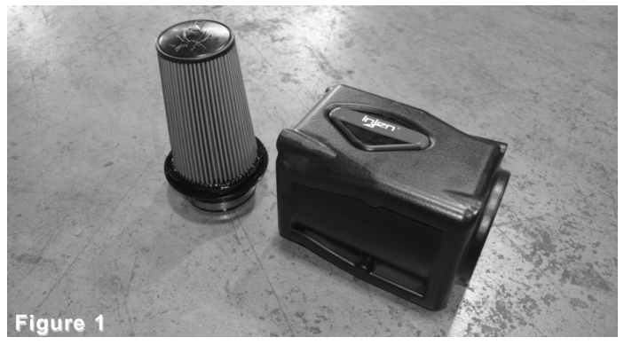
New Power flow box assembly. Twist lock filter and PowerFlow box. Box can be rotated to be either driver side or Passenger side fitment.

IMPORTANT NOTICE: InjenTechnology has re-designed and is releasing our new and improved streamlined PowerFlow Box to provide you with new cutting edge technology and a user friendly, easier installation and removal for filter maintainance. Please see below for Twist lock installation. Please refer to original installation instructions for PowerFlow box installation. Thank you for choosing injen technology.