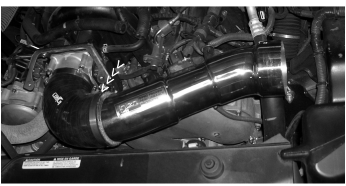
Take the assembled intake and press the 3\ 1/2 " end into the silicone elbow. Do not tighten clamp located on the silicone elbow.