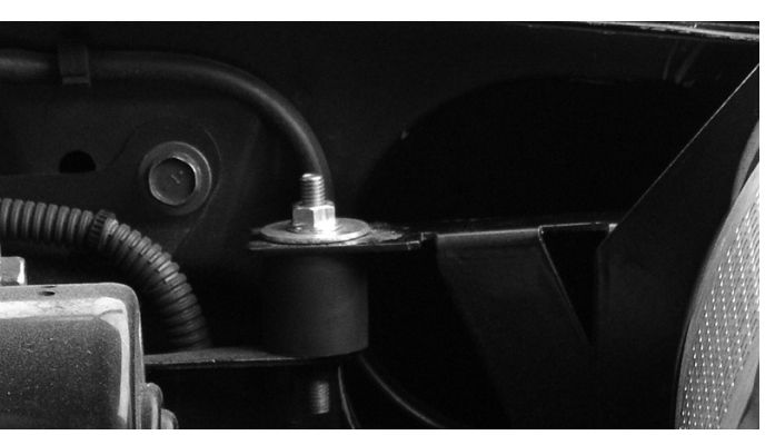
Here is a side view of the Power box bracket connected to the vibra-mount stud.