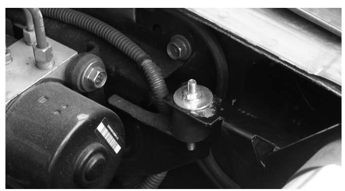
Align the Power box bracket to the vibra-mount stud and use the m6 nut and fender washer to secure the box in place.