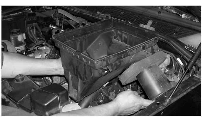
Remove flat filter panel from the filter box. Once filter has been removed, gently pull lower box out of the stock location.