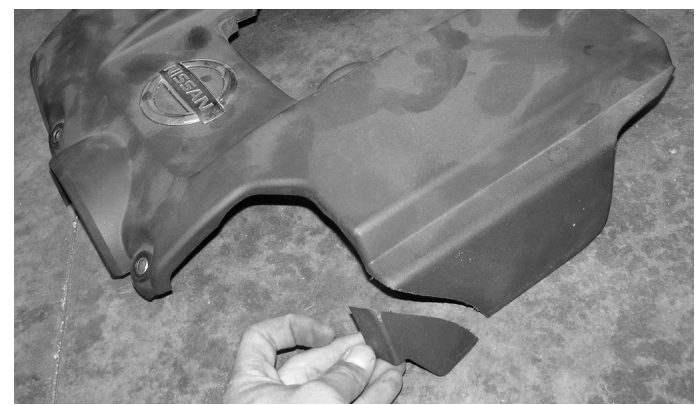
Use a utility knife to cut a small corner section as shown in this picture. Cut small sections at a time until a perfect fit is achieved,