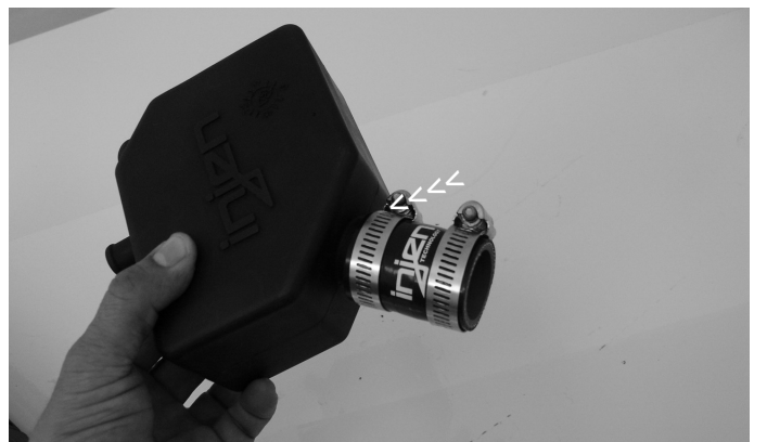
Take the CCV connecting hose and press it over the CCV box port. Use the two small clamps to hold the hose in place and tighten the clamp on the port side.