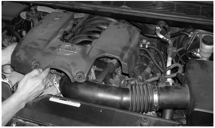
Unbolt the two front screws and remove the plastic cover located over the intake manifold.