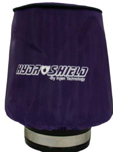
Hydro Shield Sold Separately