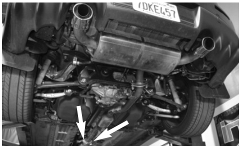
Unbolt the exhaust from the catalytic converter by removing the two 19mm nuts. Pull the exhaust off the exhaust hangers and remove entire OE exhaust system.

Please check with your local and state law enforcement agencies for exact regulation requirements.