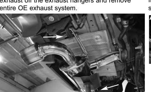
Hang the rear section onto the car and place all the hanger onto the muffler.