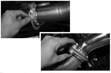
Place a gasket and two M10 nuts and bolts to secure and seal the flanges. Adjust your exhaust for best fitment and then secure the nuts and bolts. Your installation is now complete.