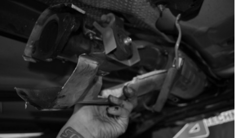
You will need to remove the top and bottom heat- Photo shown to illustrate exhaust configuration. shield on the end of the catalytic conveter. The flange on the Injen exhaust will not fit if the heatshield is not removed.