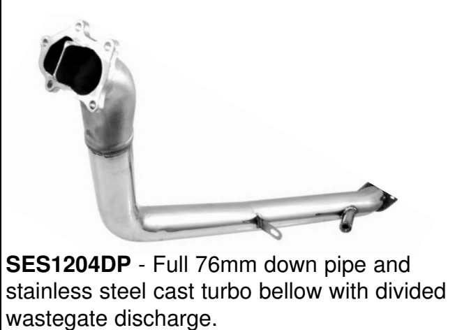
SES1204DP - Full 76mm down pipe and stainless steel cast turbo bellow with divided wastegate discharge.